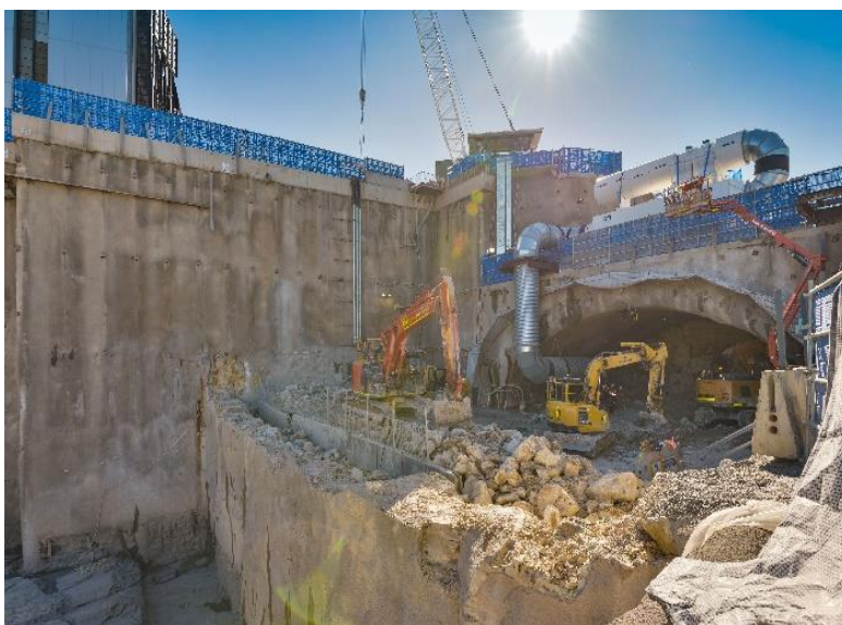
Boggo Road tunnel cavern excavation