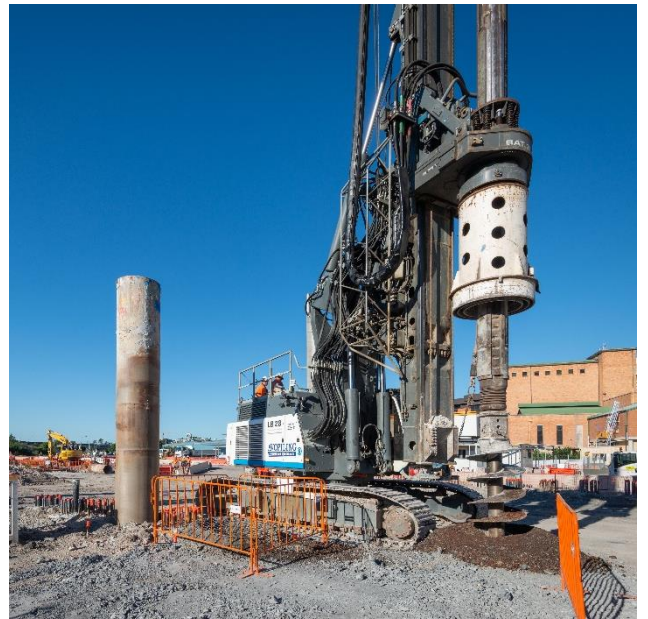
Piling works at the Southern Tunnel Portal

When required, additional notification for out-of-hours works will be provided.