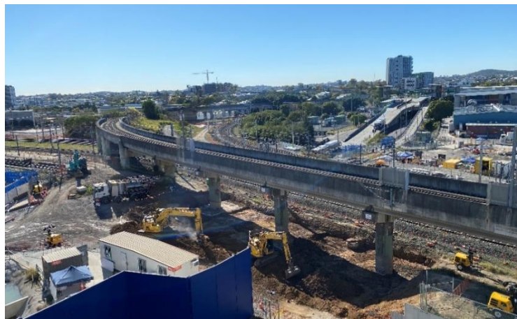
Figure 2 Aerial image of excavators working beneath the existing freight rail bridge