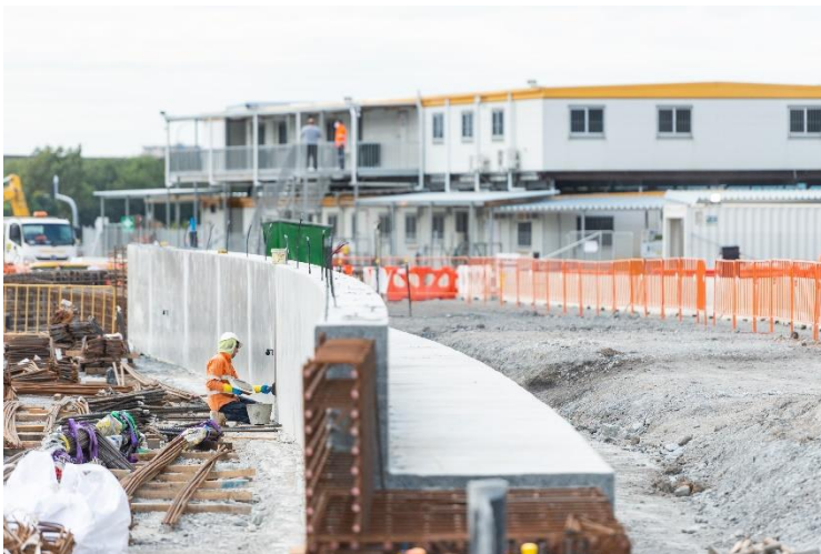
Figure 1 View within the Southern Tunnel Portal of foundation works