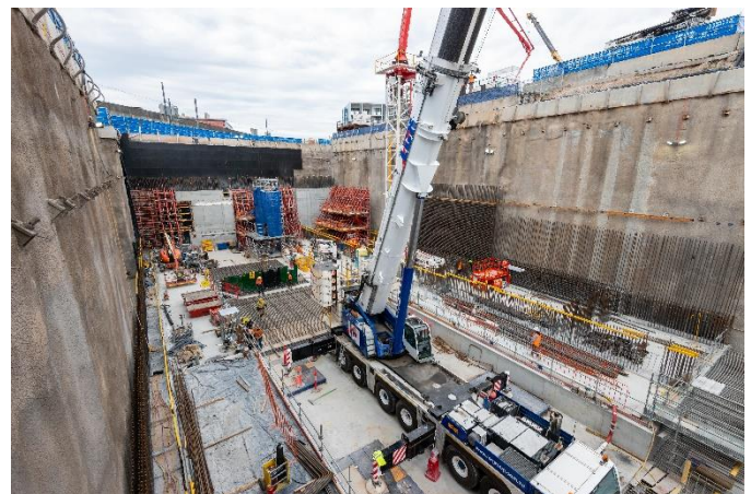
Figure 4 Station construction underway

These works may generate medium to high levels of noise.