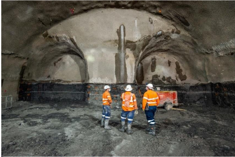
Figure 5 View of the tunnel cavern face from the station box