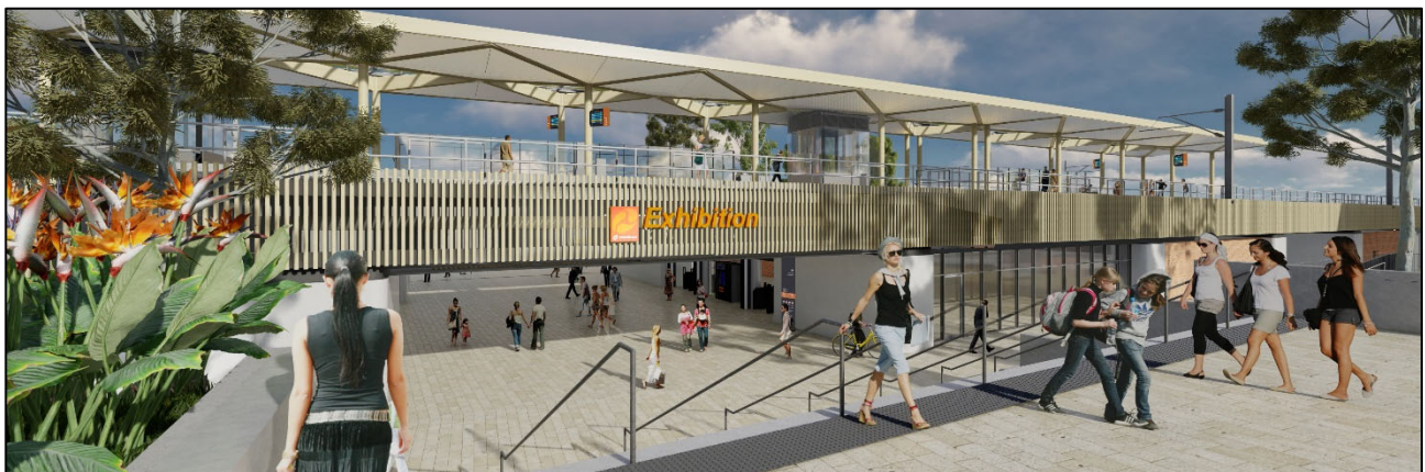
Artist impression of Exhibition station entry via RNA Showgrounds Grand Plaza, Gregory Terrace.