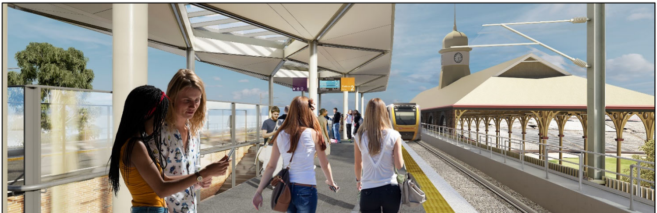
Artist impression of Exhibition station platform looking north towards the RNA Showgrounds, John McDonald Stand.