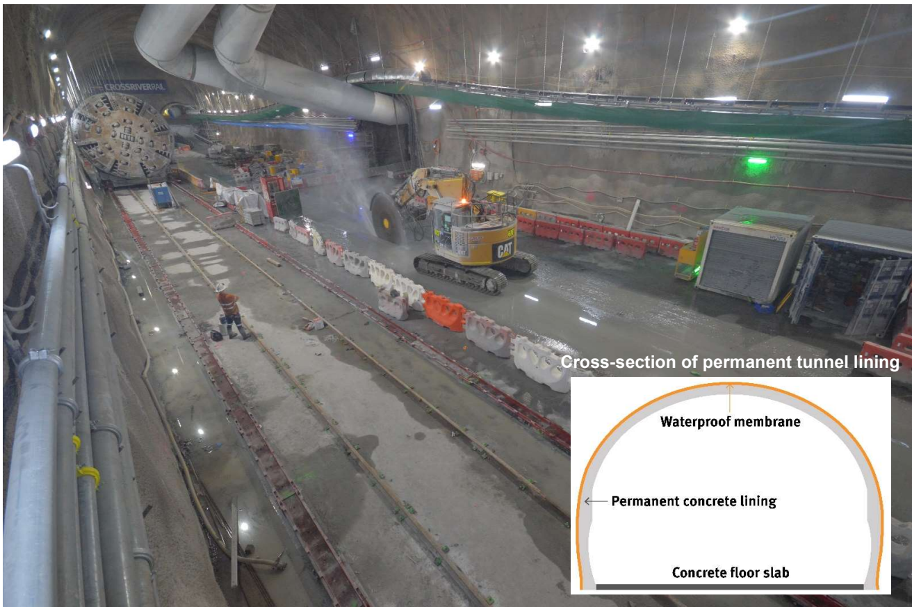
Cross-section of permanent tunnel lining

The underground team will now continue excavating the passenger access tunnels, installing cavern inground drainage and starting to construct the permanent concrete lining of the cavern.