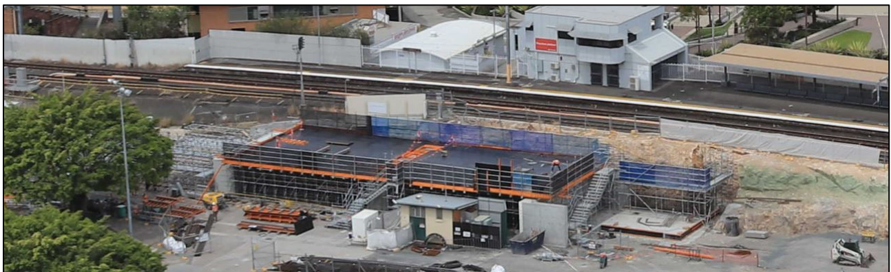
Preparation works to construct the new Exhibition station twin track bridge deck.