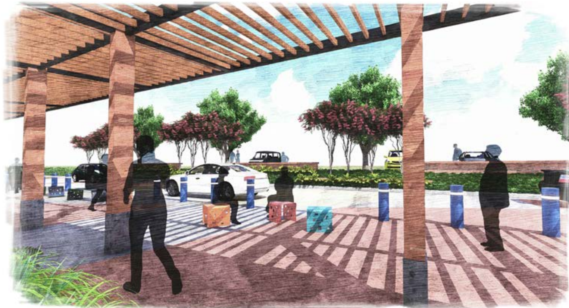
School Drop Off Area

Burgmann is in a position to act and is seeking to create a high-quality transport network which supports improved vehicle and pedestrian movements. Burgmann is taking a proactive role and is responding to the current and future needs of the school and Gungahlin community.