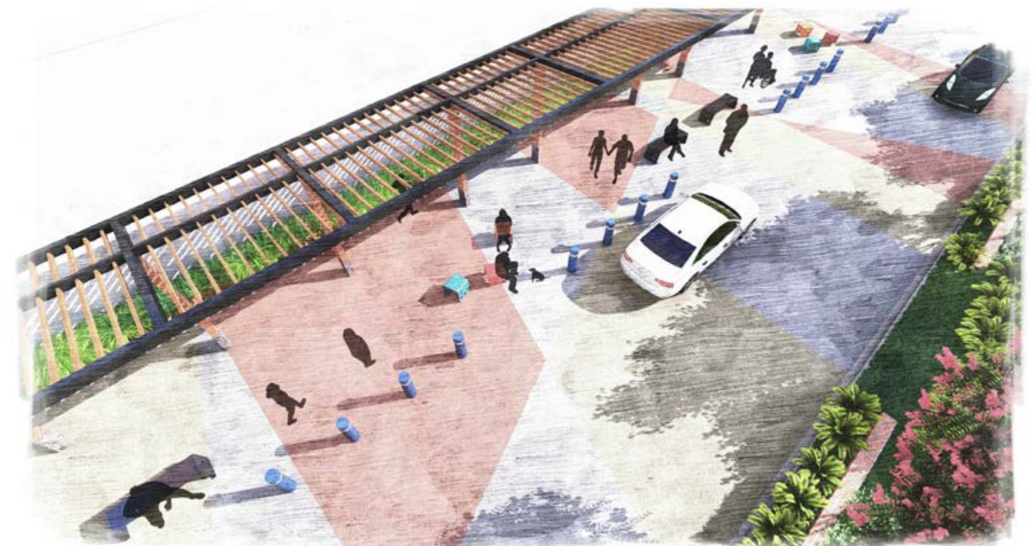
School Drop Off Area

The proposal is seeking to improve the overall accessibility and safety for students and residents. This proposal will better manage vehicles and enhance the amenity and heritage values of the area. The scope of work includes: