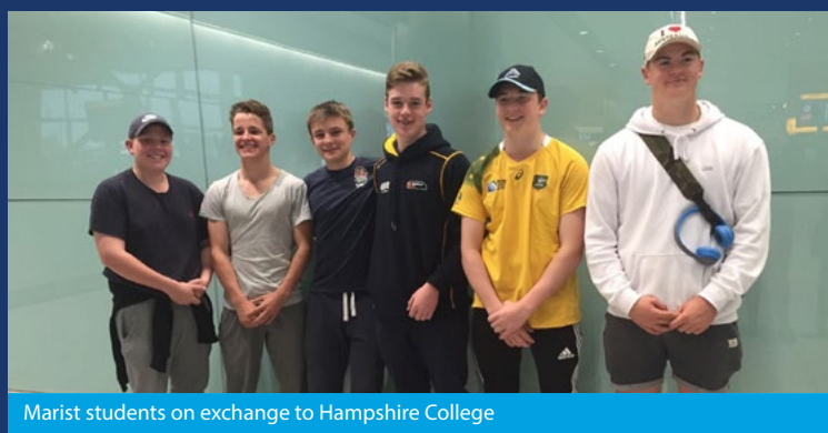
Marist students on exchange to Hampshire College