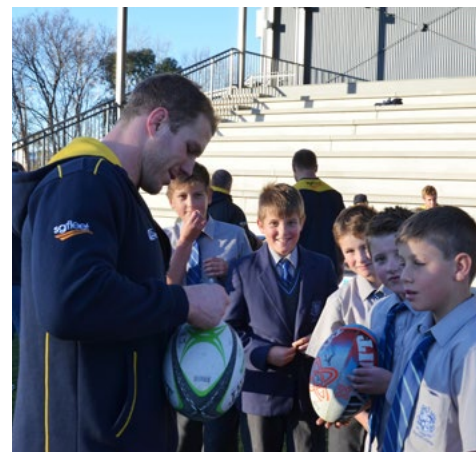
Brumbies player David Pocock at Marist Rugby training