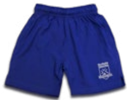
Sport Shorts (Boys Prep - 12) (Girls Year 3-12)