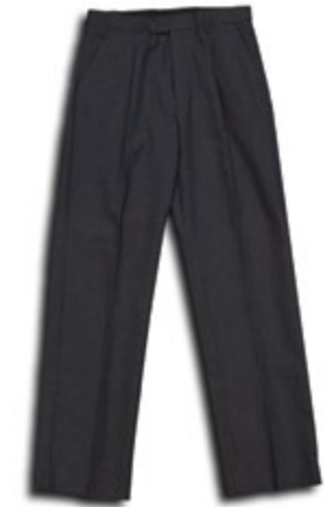
Boys Grey Trousers (Year 7-12)