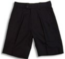
Boys Belted Shorts (Year 4 - 12)