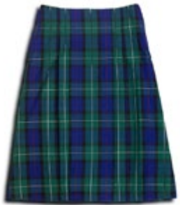
Girls Skirt (Year 7 - 12)