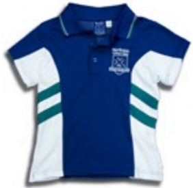
Girls and Boys Sport Polo (Prep - 12)