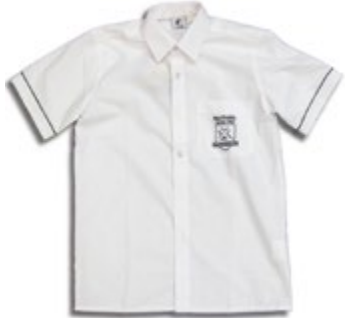
Boys Secondary shirt (Year 7-12)