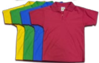
Girls & Boys House Colour Polo (Yrs 1-12)