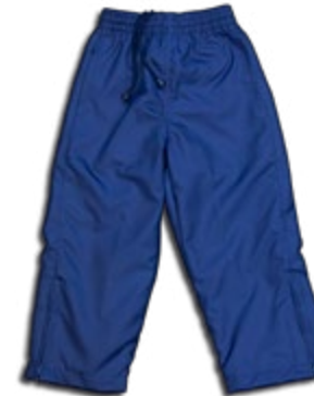
Girls and Boys Track Pants (Year 1 - 12)

NCC Tracksuit top may be worn over (but not instead of) jumper