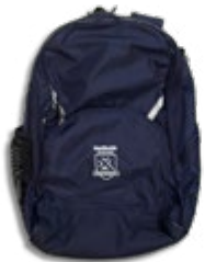
Northside School Bag