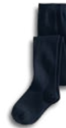
Navy Knitted Tights or Navy Lycra Stockings