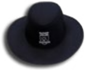
Wonder Hat (Year 3-9)