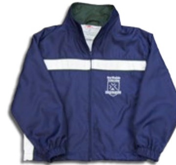
Girls and Boys Track Jacket (Year 1 - 12) (sports uniform only)

NCC Tracksuit top may be worn over (but not instead of) jumper