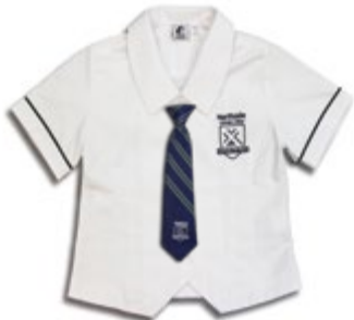
Girls Blouse (Year 7 - 12)