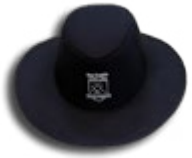
Wonder Hat (Year 3 - 9)