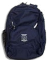
Northside School Bag