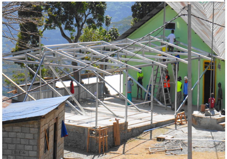
CONSTRUCTION IN PROGRESS