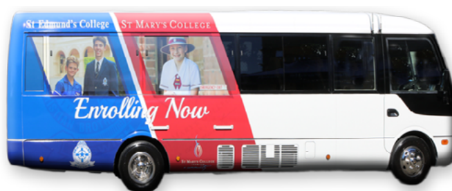
New St Mary's / St Edmund's Bus