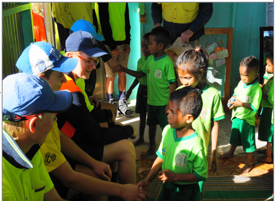
TIMOR IMMERSION GROUP WITH CHILDREN OF THE LOCAL TIMOR LESTE COMMUNITY