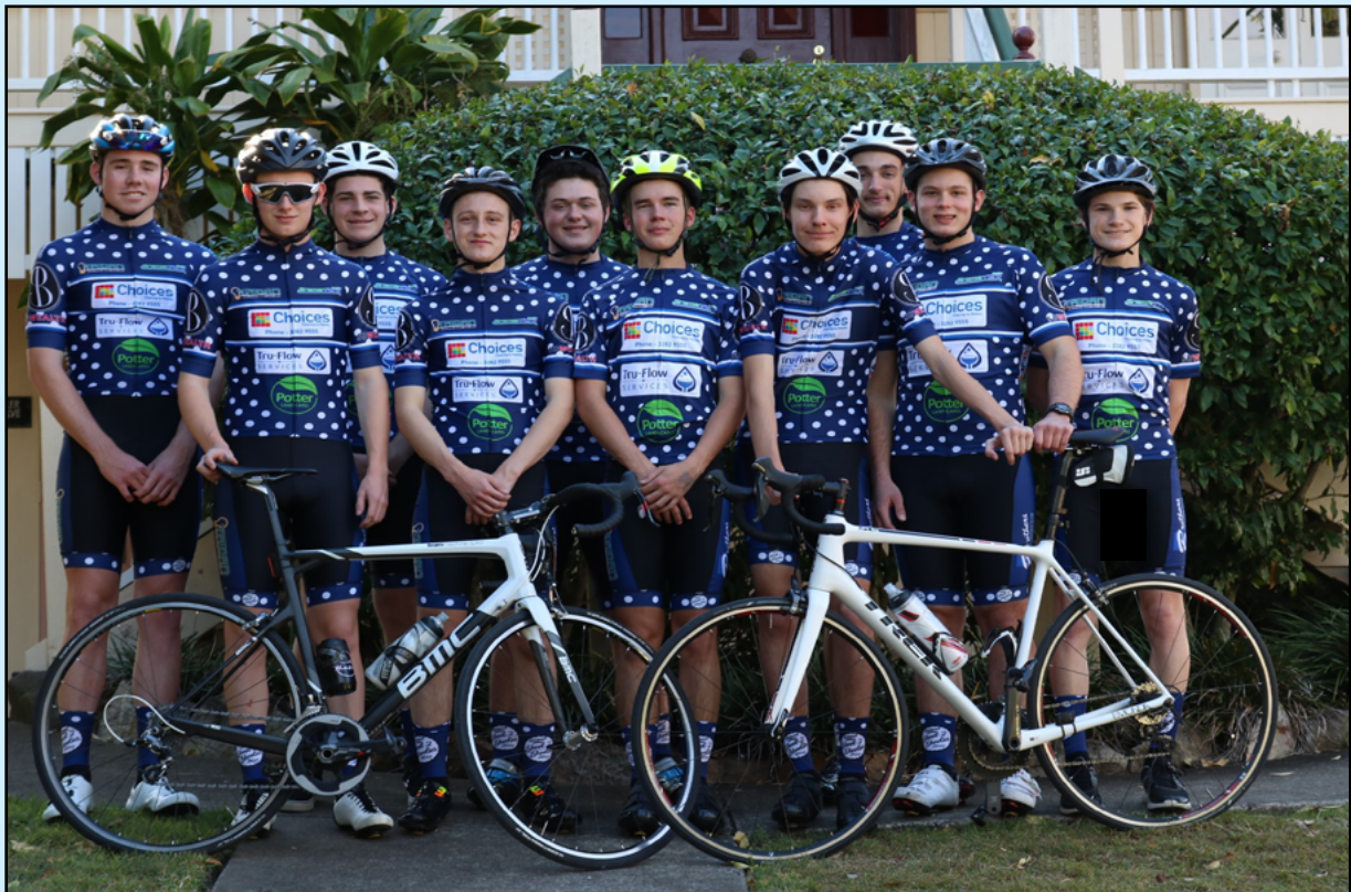
2017 SKOOL2SKOOLIES TEAM