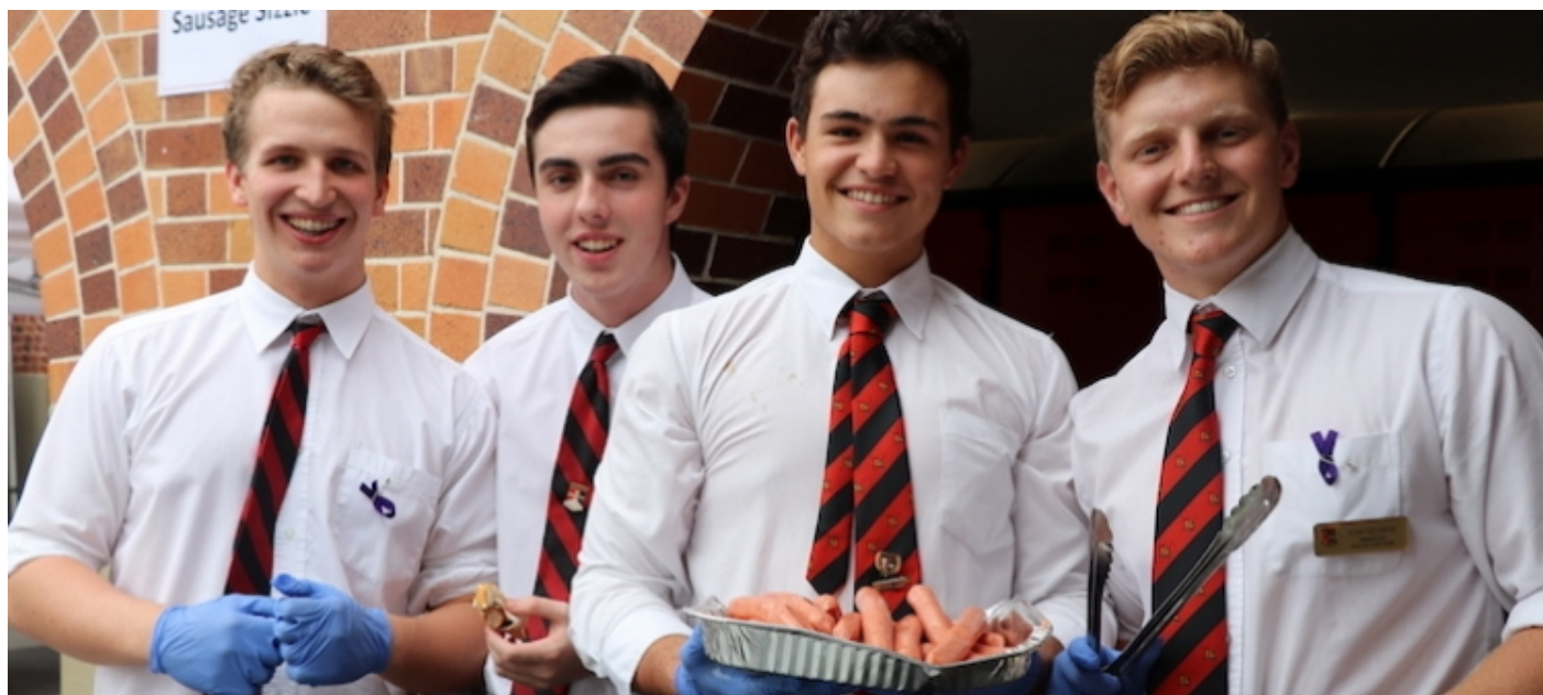
The Senior students lending a helping hand on Open Day.

A very successful Open Day was enjoyed here at the College this week.