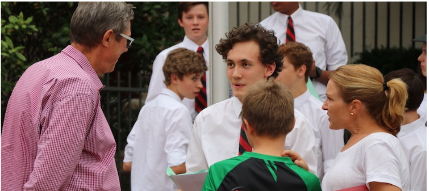
Tours of the College led by Year 11s on Open Day

Schools are relationship-based environments and we rely on our students building an atmosphere where all feel safe and welcome.