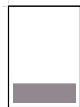
QUARTER PAGE H 60mm x W 170mm no bleed required