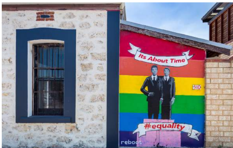
Cnr Little Lefroy Lane & South Terrace