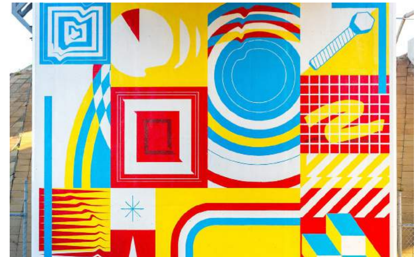
North Fremantle rail bridge base