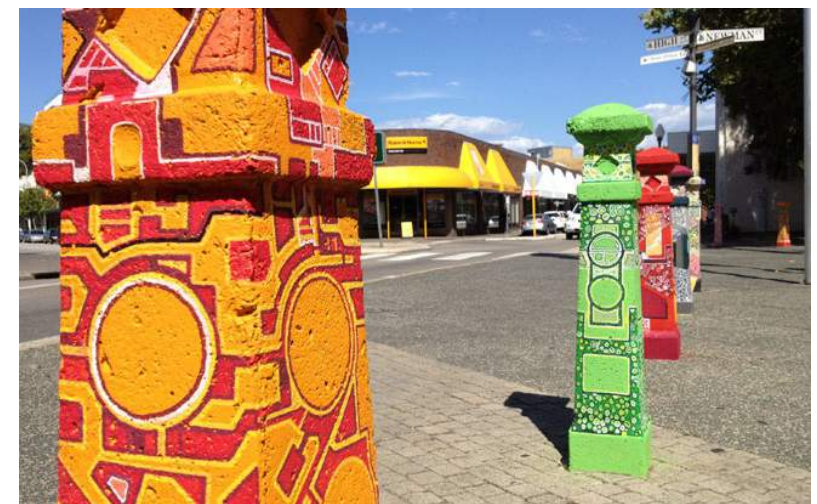
Queen Street - Kings Square