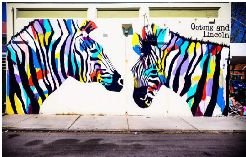
Cnr Silver Street & South Terrace

Street Art around Fremantle - the inspiration for street painting graphics