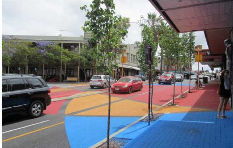
Beaufort Street, Mount Lawley

Road Art around Perth – the inspiration for using paint to reduce vehicle speeds in shared zones