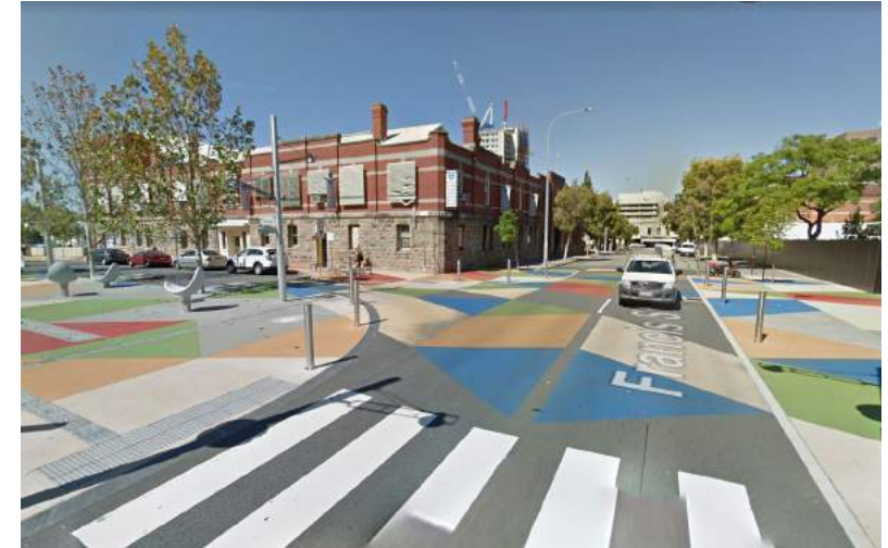
Francis Street, Perth

Street Art around Fremantle - the inspiration for street painting graphics