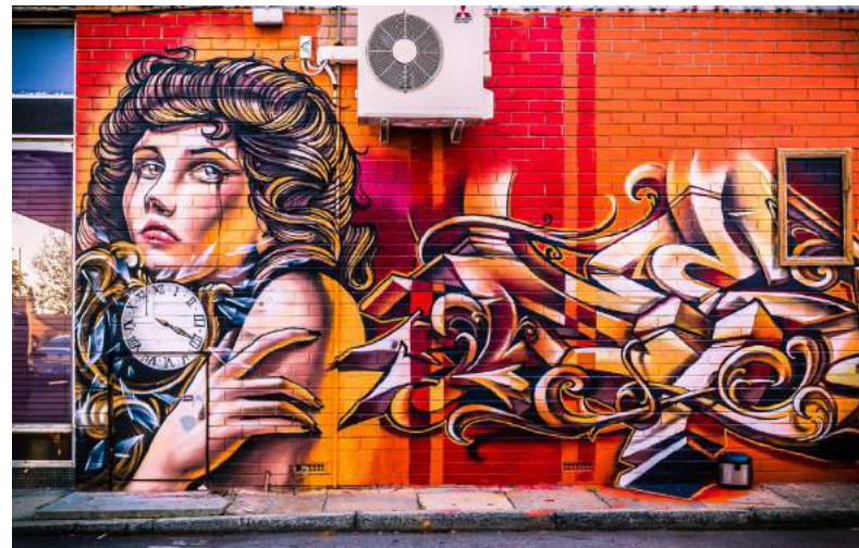
Alley accessed off Point Street