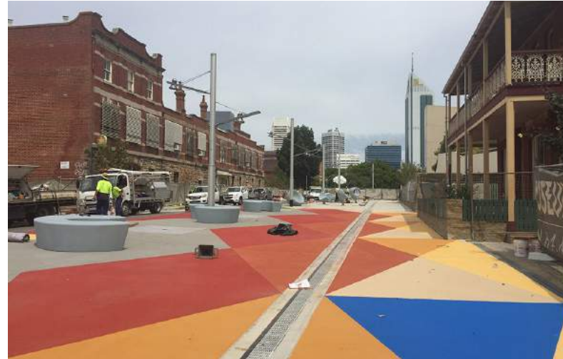
Museum Street, Perth