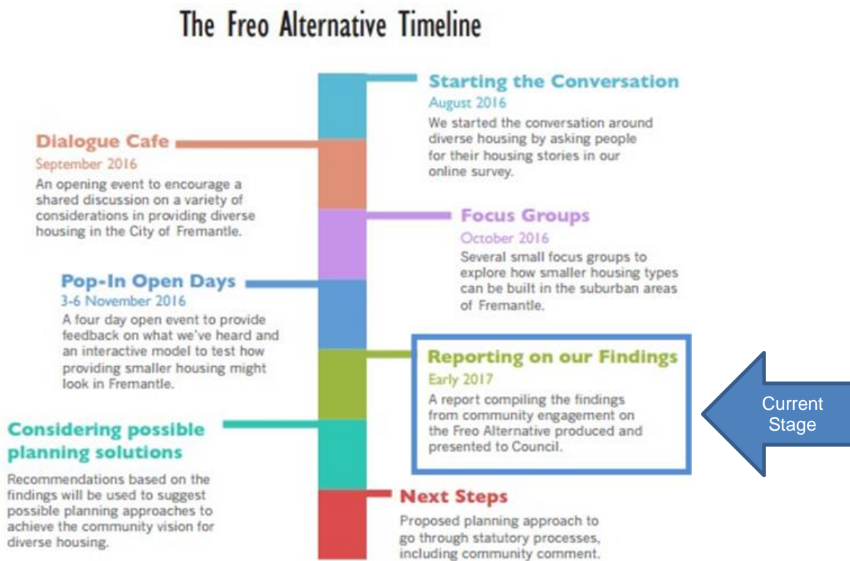
Figure 1. Freo Alternative Timeline

open days in November 2016. The timeline and individual activities within the engagement process are illustrated in figure 1 below. Detail on the engagement events is provided in attachment 1 , including dates and attendance numbers.