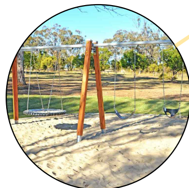
Timber swing with toddler seat, accessible birds nest swing and coloured rubber softfall