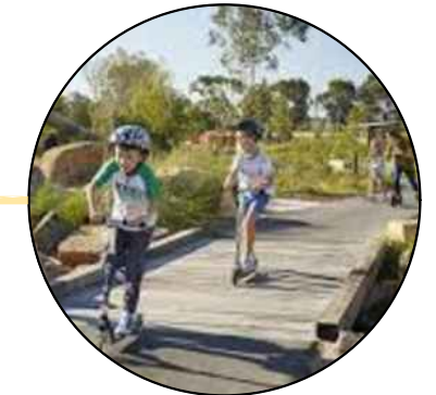
Internal scooter pathways between 1.5m to 0.8m wide