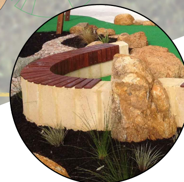
Curved seating to create yarning circle with public art inserts