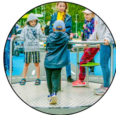
Accessible carousel with coloured rubber softfall beneath