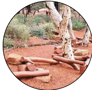
Nature play elements