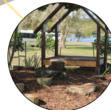
Nature play elements with cubby house