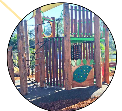
Central climbing equipment with coloured rubber softfall to provide wheelchair access to lower level