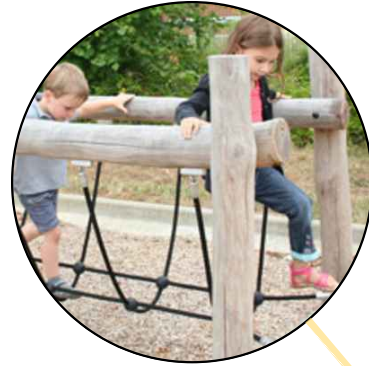
Timber balance trail