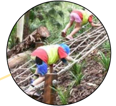
Climbing net over landscaped mound with log steps either side