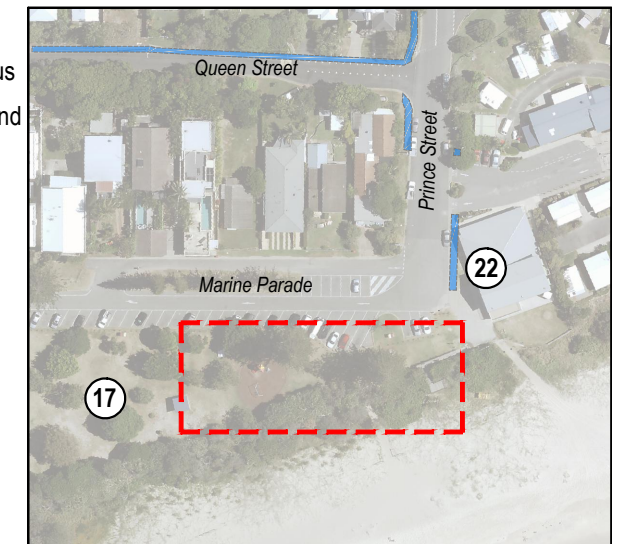
Location of park, playground and existing pathways