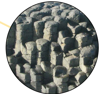
Basalt rocks to be used as stepping stones/seating and represents a feature of the Fingal Head landscape