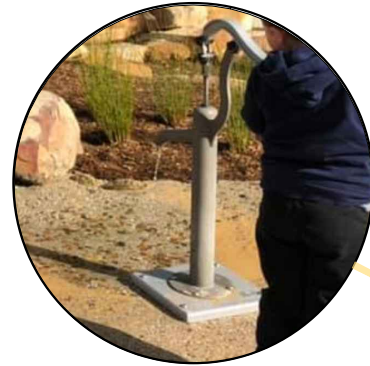
Water pump to encourage play in dry creek bed (in blue)