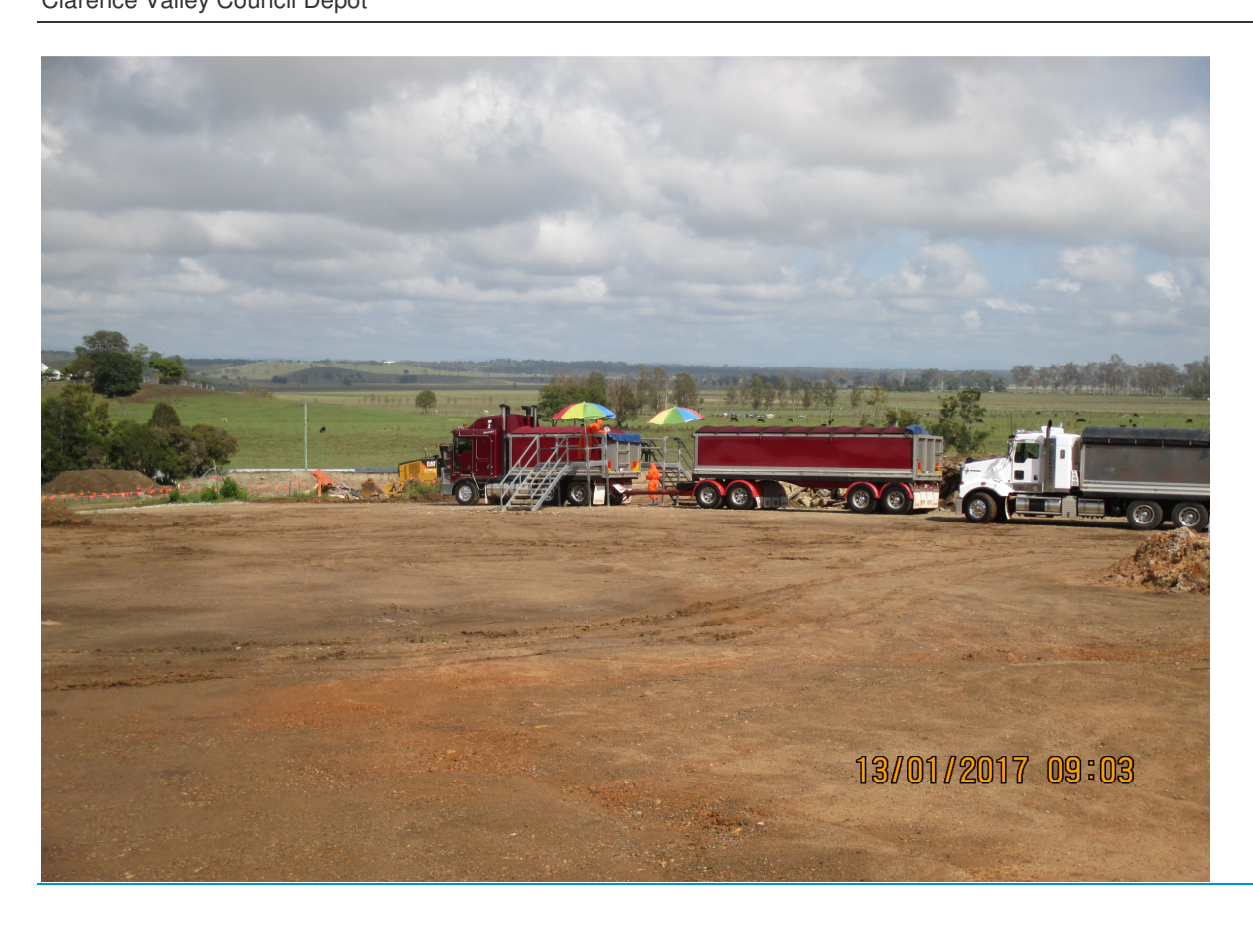
Tarp Tie down Procedure prior to entering wash bay: