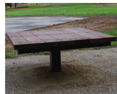
3 Table seat