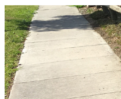
11 Improved paths