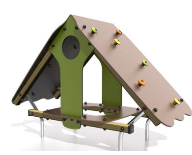
4 Climbing hut