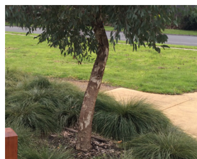
5 Trees and plants