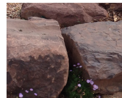
8 Mudstone rocks