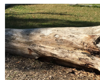
10 Timber log