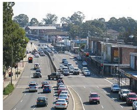
The main retail area on Yagoona is located along the Hume Highway

The head office of RSPCA NSW is located in Yagoona on Rookwood Road.