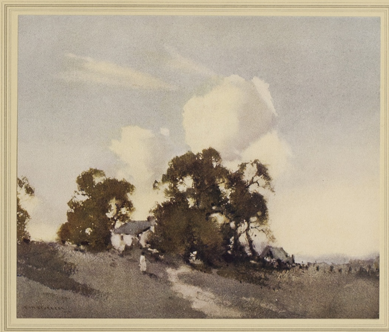
Plate No. 9