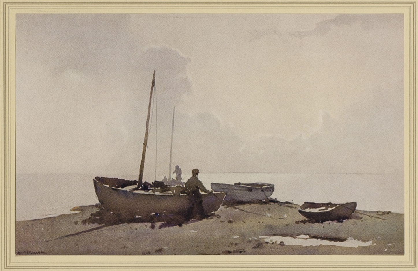
Plate No. 13