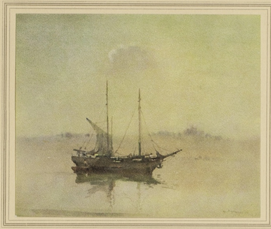
Plate No. 18