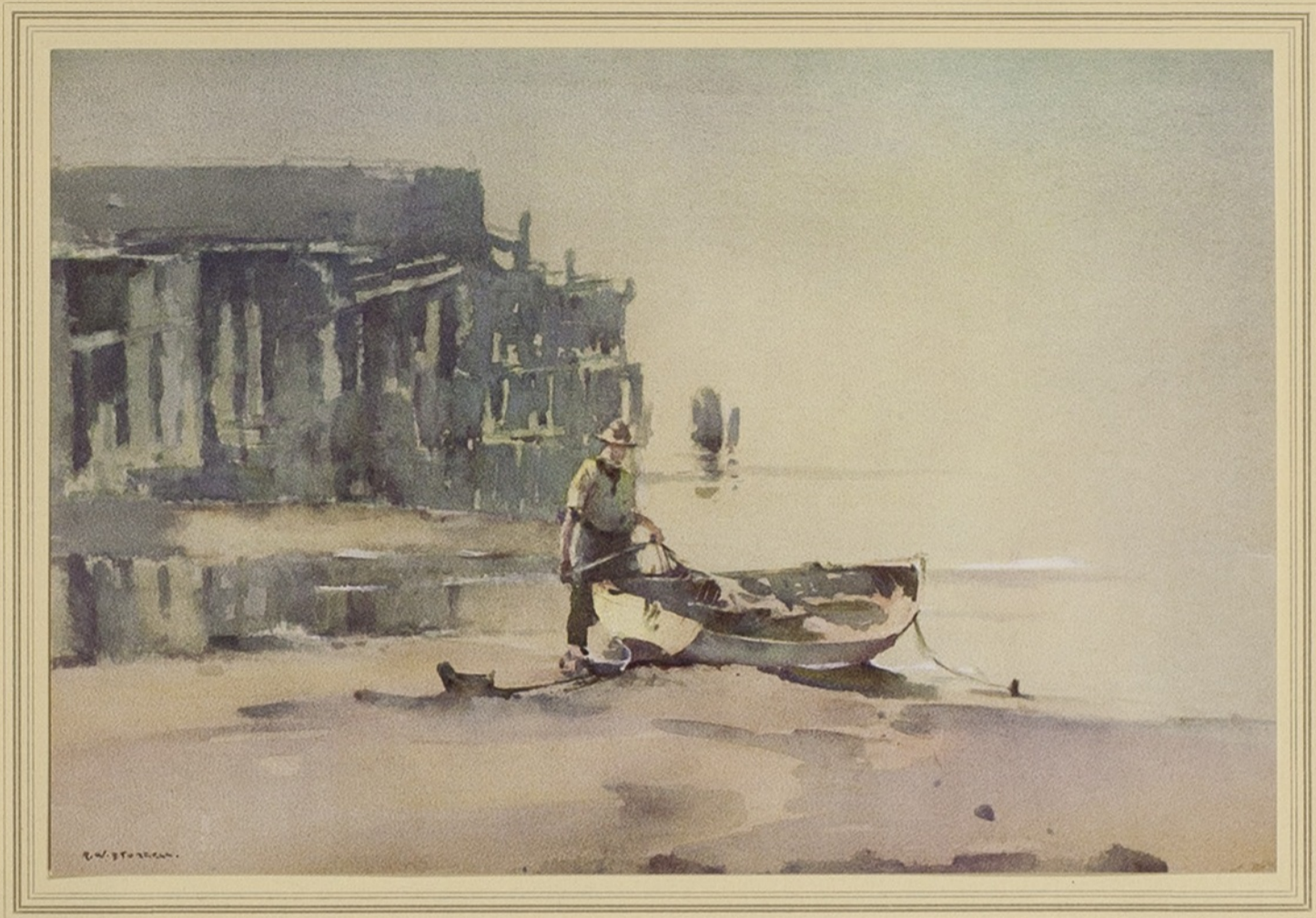
Plate No. 3