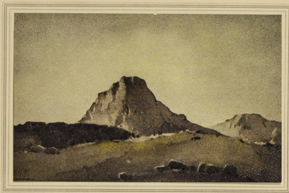
Plate No. 16