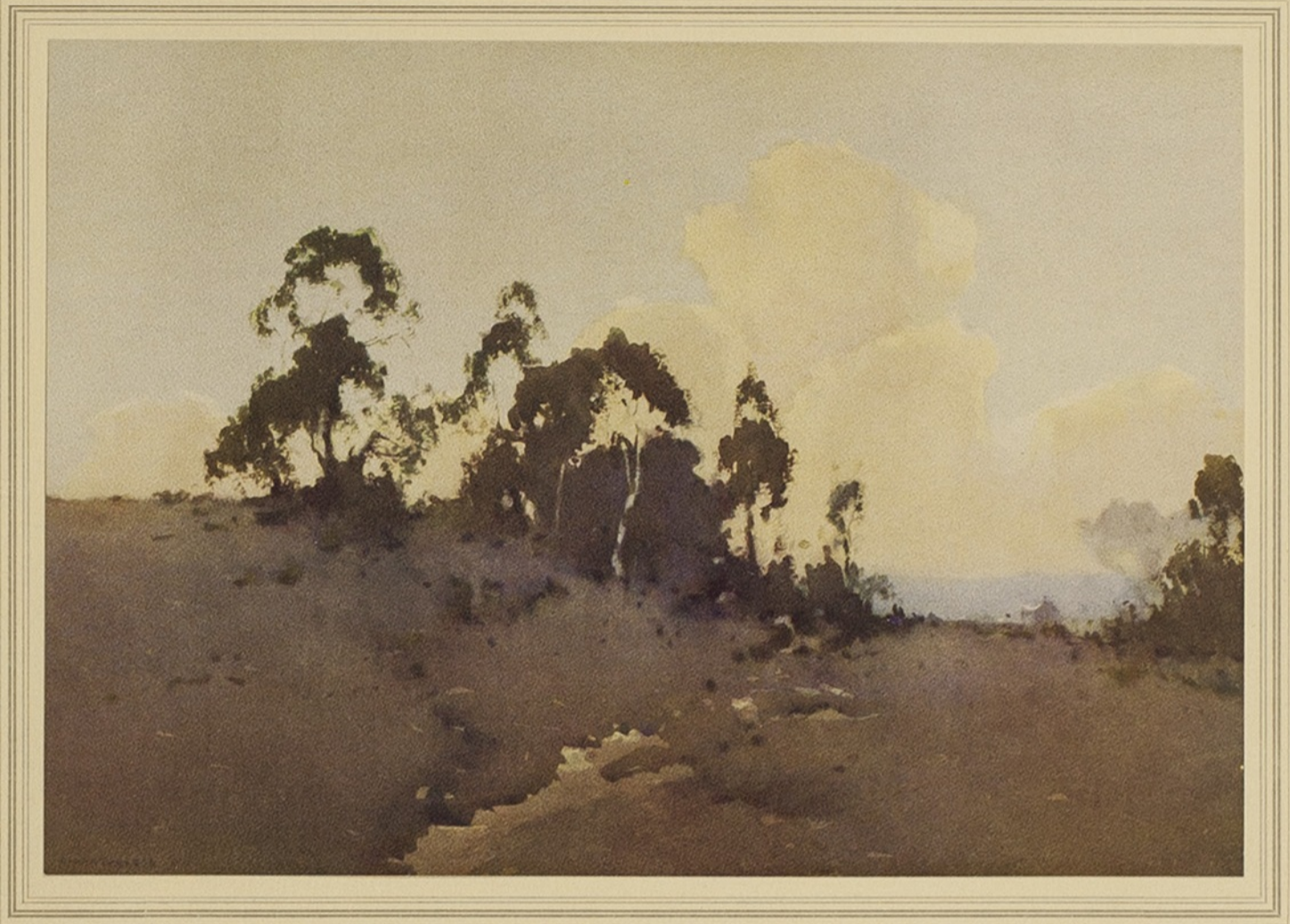
Plate No. 4