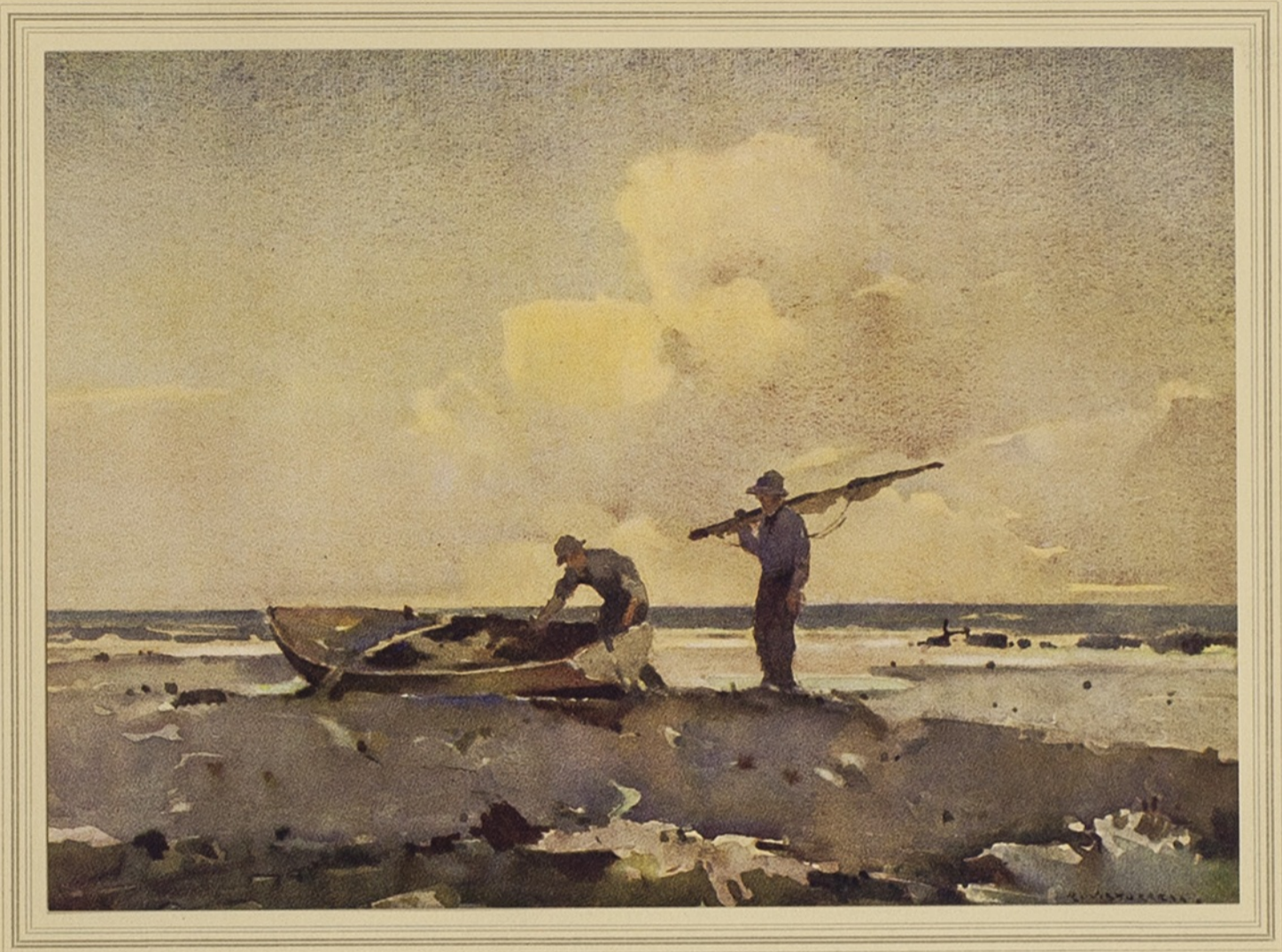
Plate No. 11