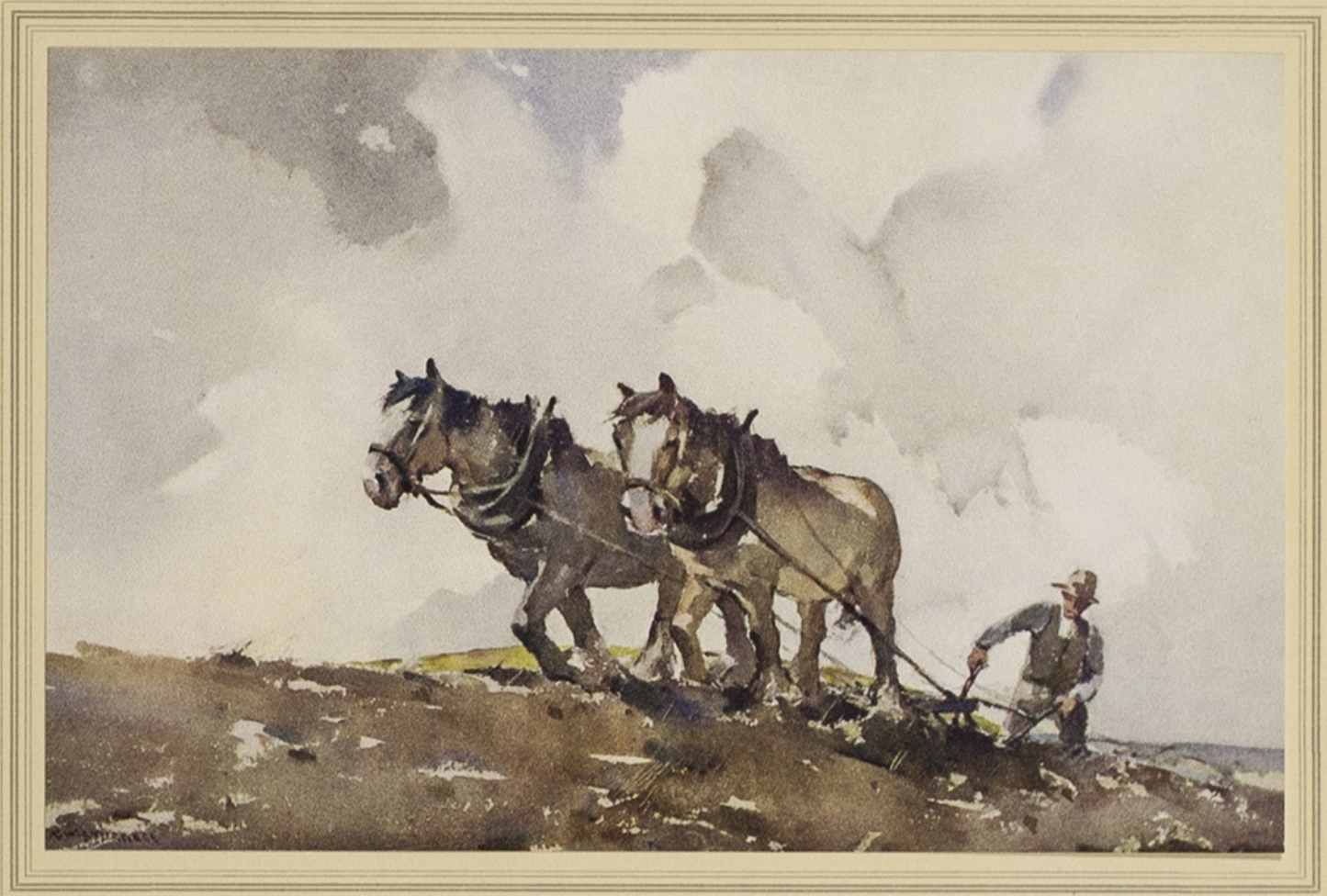
Plate No. 5