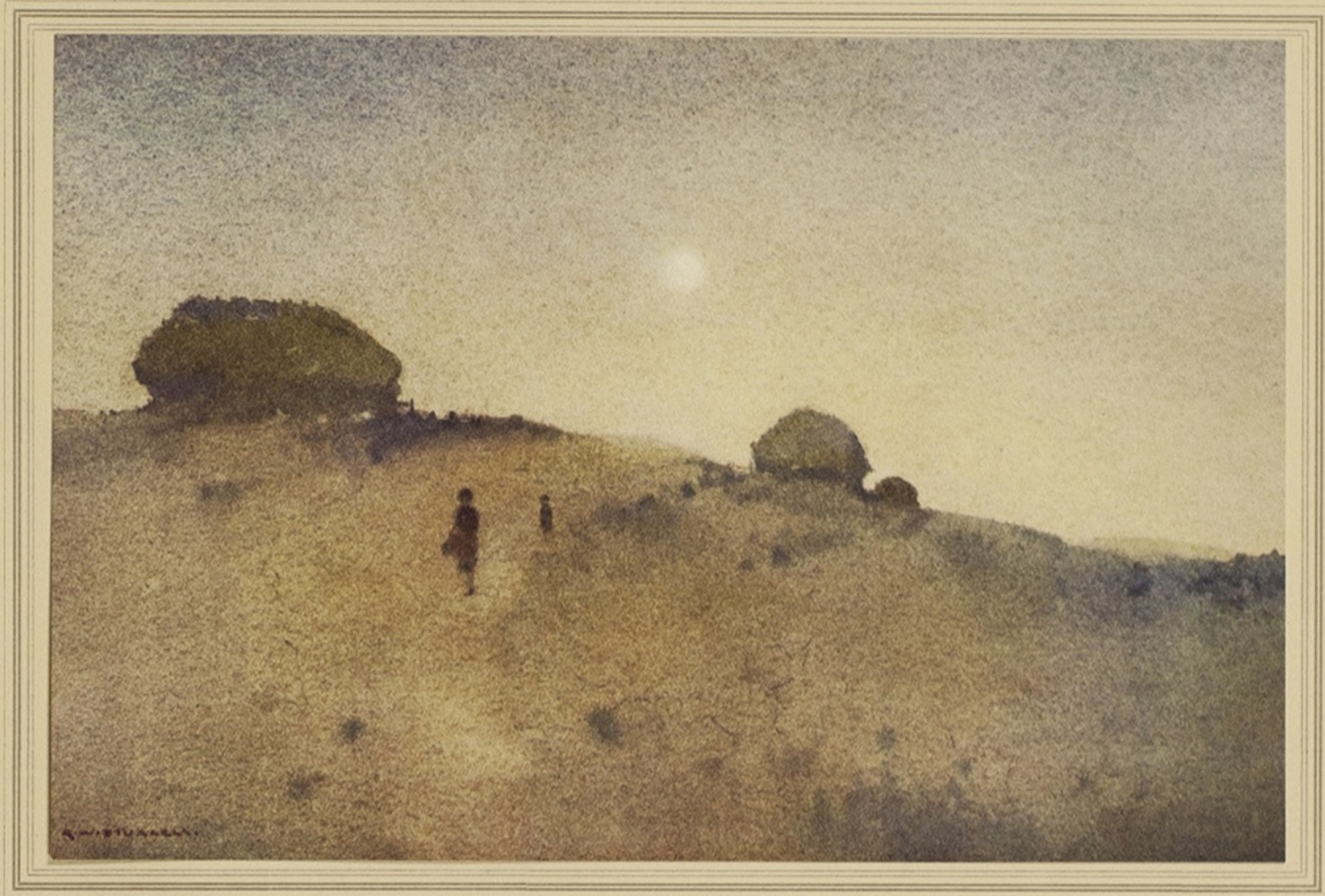
Plate No. 15