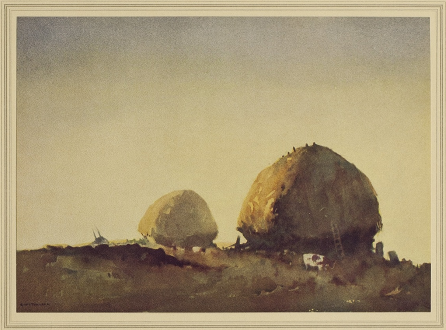
Plate No. 2