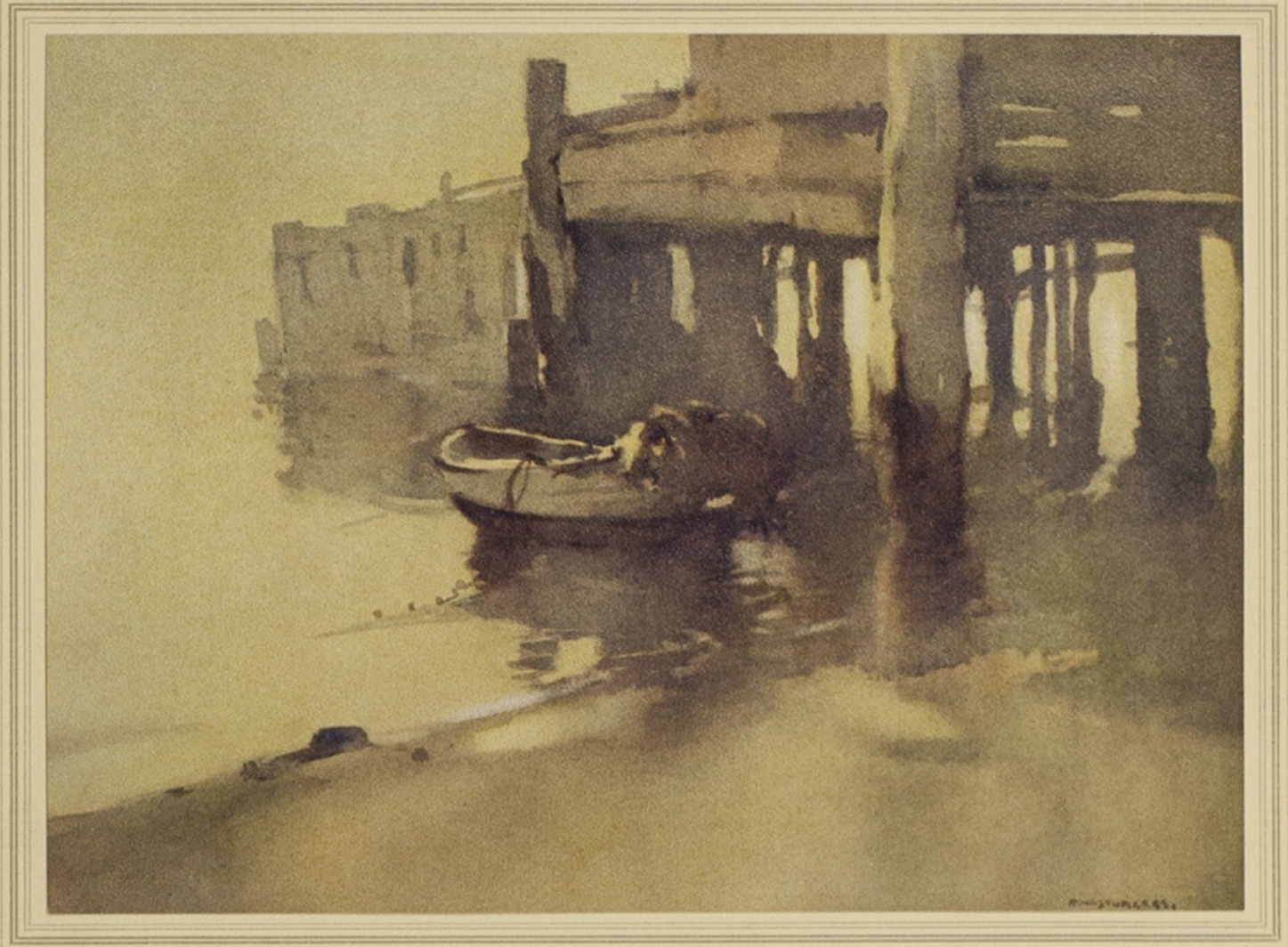
Plate No. 6