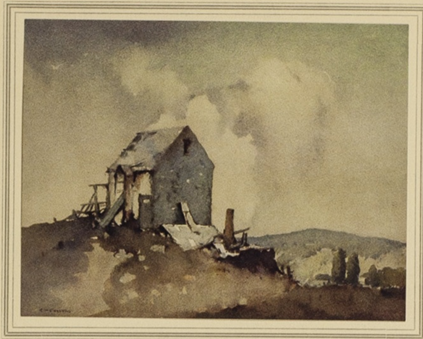
Plate No. 17