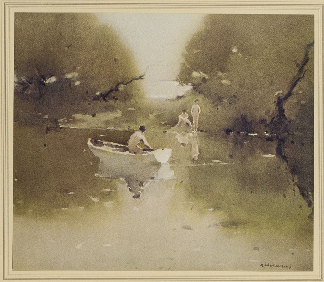
Plate No. 10