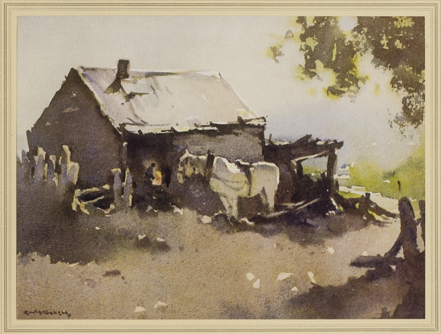
Plate No. 12