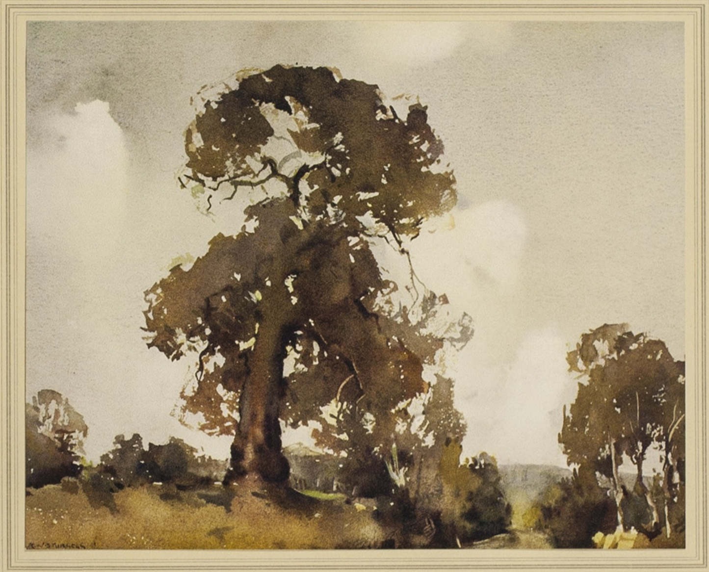
Plate No. 14