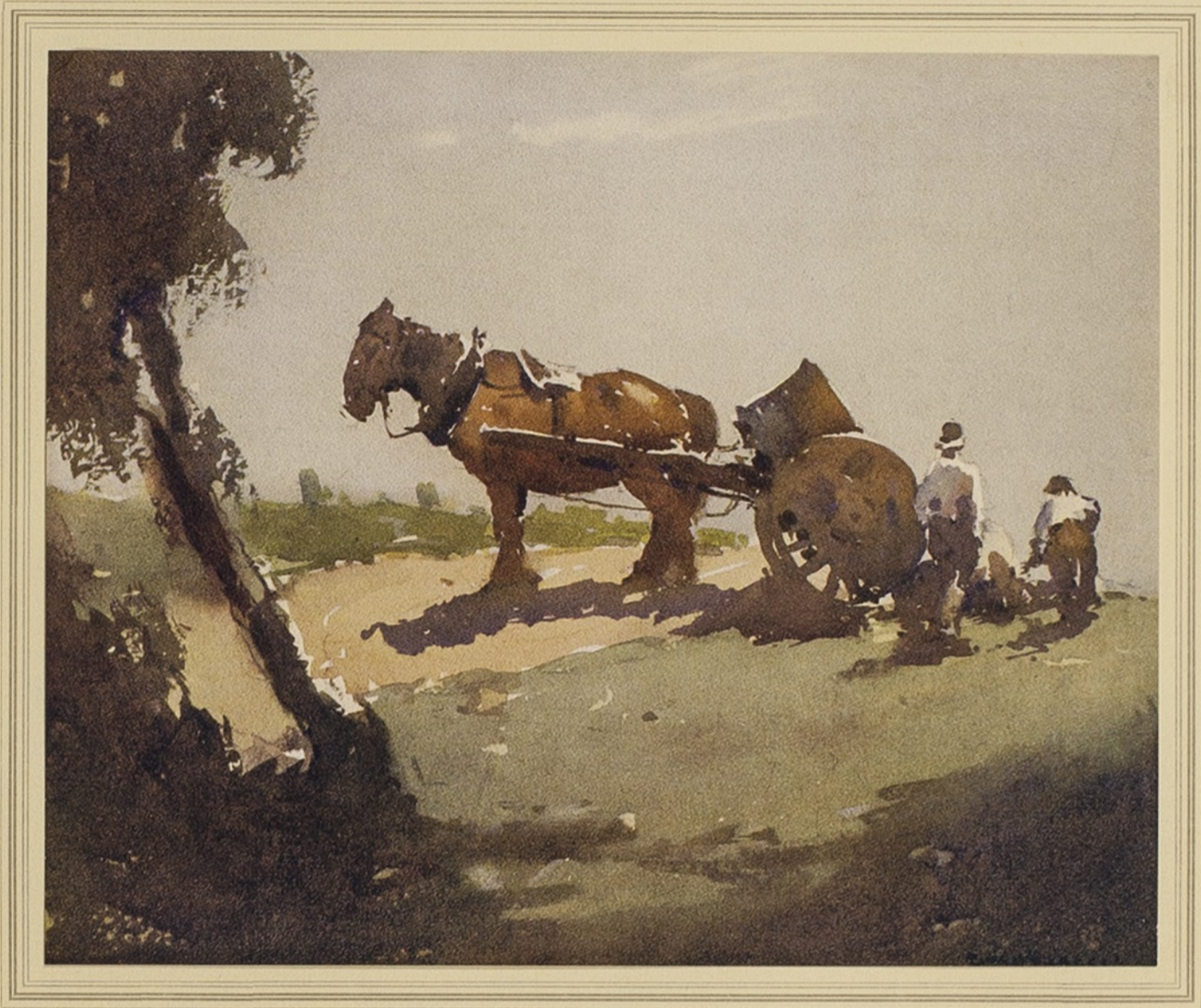
Plate No. 1