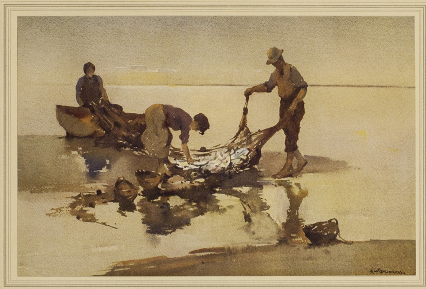
Plate No. 8