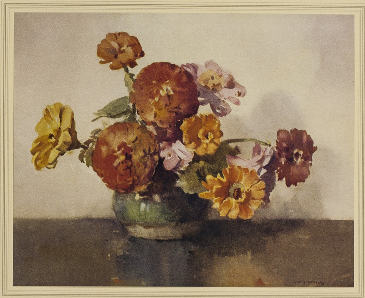
Plate No. 7