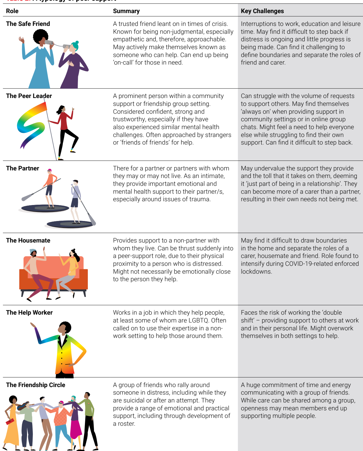
Table 2. A typology of peer support