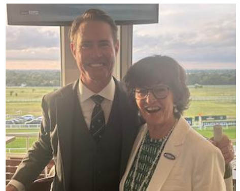
The Carbine Club of London – pics from Cheltenham Raceday in the Royal Box