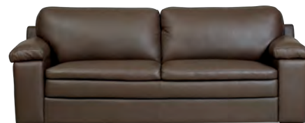
3 SEAT DUO