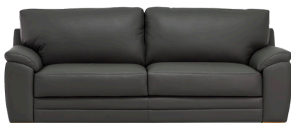
3 SEAT DUO