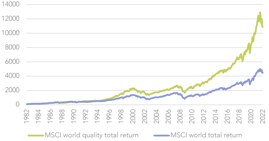
Figure 4: Quality has outperformed over the long run

*Using an equal weighted portfolio of the healthcare, comm svs, consumer staples and utilities.