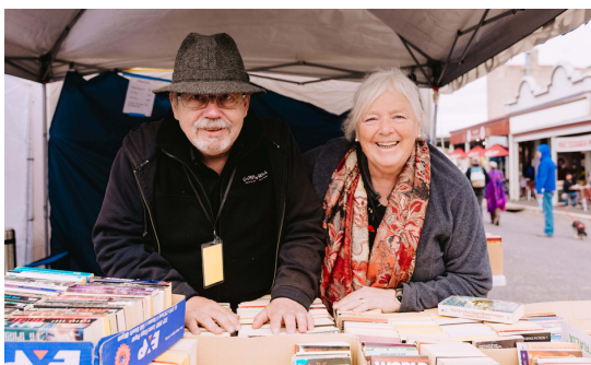
Image from 2019 Clunes Booktown Festival

For this festival we are programming another amazing line up of talented writers, storytellers and artists to come to Clunes to entertain, wow, inspire and uplift us all. We will be approaching the festival with safety in mind and will be taking precautions, as we did for Turn The Page in 2021, to keep our community and visitors safe. We will also look at programming some online events so those in our community who want to enjoy components of the festival from home can do so.