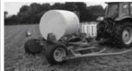
VICON DUO WRAP BALER BW2600, FULLY AUTOMATIC IN STOCK NOW