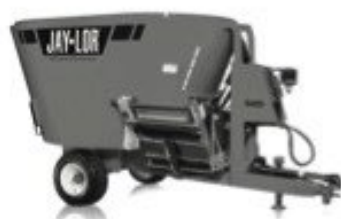
JAYLOR 5425 MIXER IN STOCK NOW