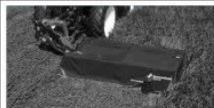
KVERNELAND TAARUP TA LINKAGE DISC MOWER 6, 7 OR 8 DISC AVAILABLE AVAILABLE FOR THIS COMING SEASON