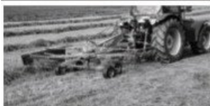
KVERNELAND TAARUP 3.5 METRE SINGLE ROTOR RAKE