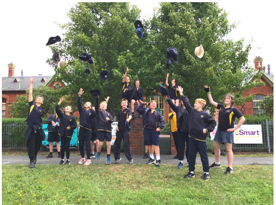
Hats off! Grade 6 graduation 2021. See page 4