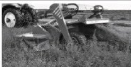
KVERNELAND TAARUP TRAILING MOWER CONDITIONERS 3.2 & 3.6 METRE CUT WITH ROLLER CONDITIONERS AVAILABLE FOR THIS COMING SEASON