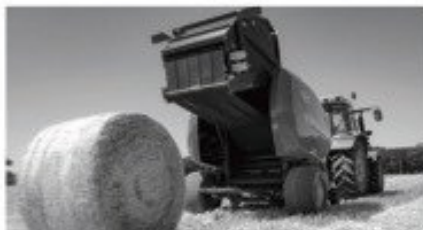
VICON ROUND BALER RV 5216 IN STOCK NOW