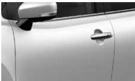
Premium Arctic White (ZHJ)