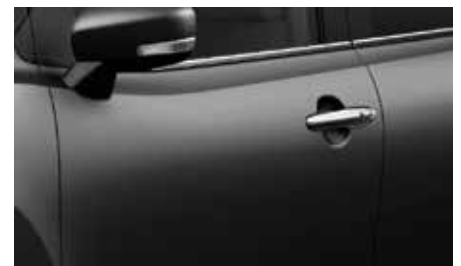
Granite Grey Metallic (ZTN)