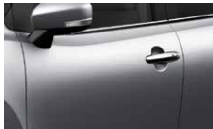
Premium Silver Metallic (ZQS)