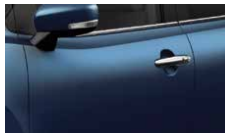
Premium Ray Blue (Z9Q)