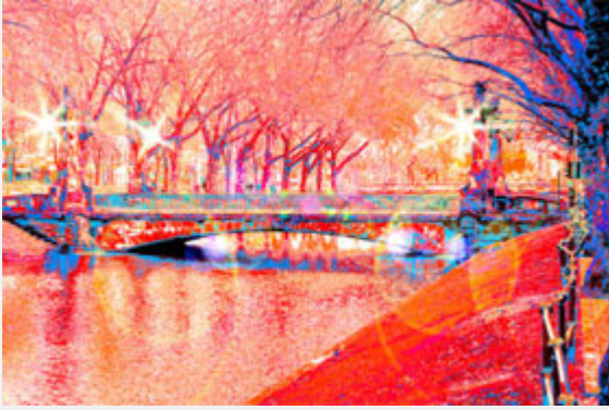
GIRARDET © Holger Stoldt