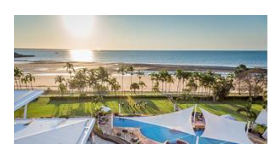
Program of Events