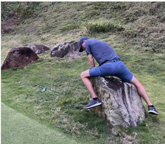
Challenging short game