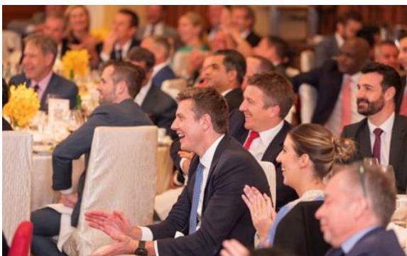
The main ballroom of the Hyatt Regency entertained by the two guest speakers

The lunch was a huge success given the wonderful job the Hyatt Regency do with the service along with the excellent food and beverage. Thanks to all members and their guest for attending the event and supporting Cricket, our event charity, the Cricket Hong Kong, China Charitable Trust and the Carbine Club of Hong Kong.