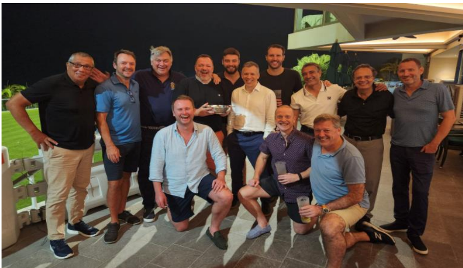
Members and Guests