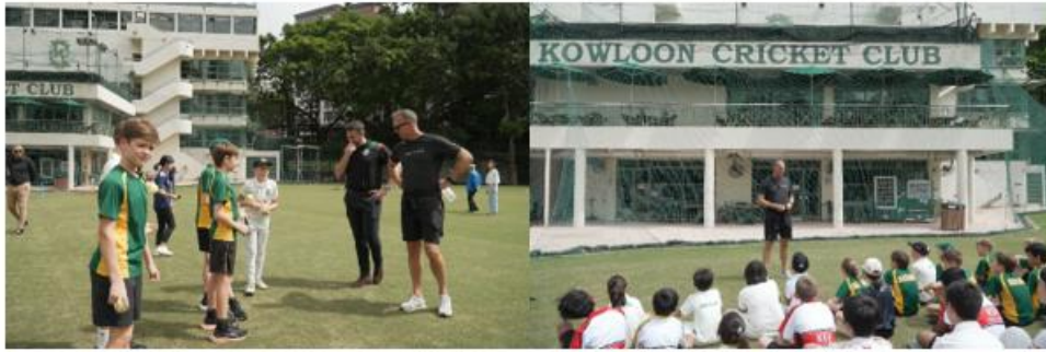
Michael Vaughan OBE overseeing a cricket clinic during his one day trip to Hong Kong