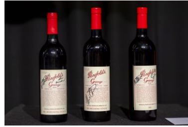
Above -Damien Oliver's Melbourne Cup winning rides - Penfolds Grange 1995, 2002 and 2013