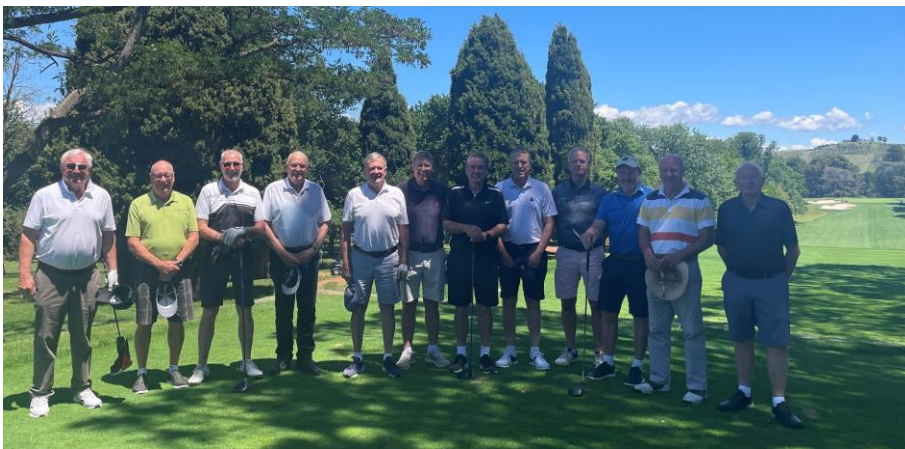
L-Members prior to teeing off in the eleventh annual Russell Parkes Memorial Golf Day

The Carbine Club of the ACT wishes our fellow Carbine Clubs all the best Christmas and 2024. Our first function for the year will be our annual Black Opal Stakes Racing Luncheon on Friday 8 March at the National Press Club of Australia.