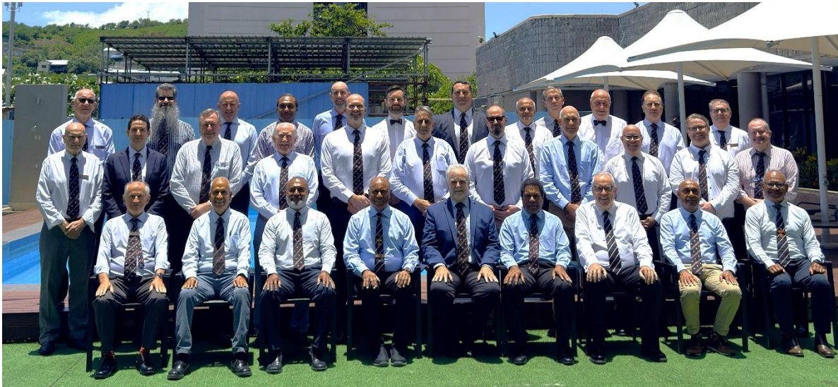
Carbine Club of Papua New Guinea – AGM 2026