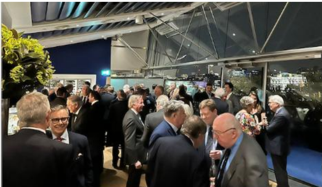
Club members and guest enjoying a pre-dinner drink

Then it was time for quiet road-ale and coaches home.