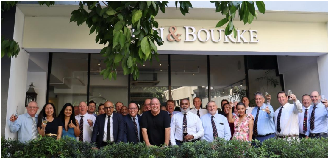
Bondi & Bourke, Makati City.