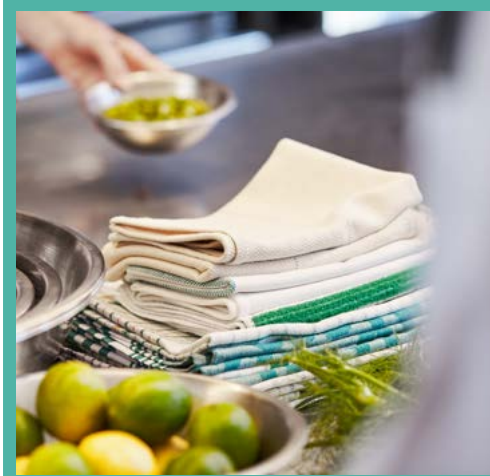
Tea Towels & Wipes Tea Towels, Glass Cloths, Industrial Wipes & Microfibre Wipes