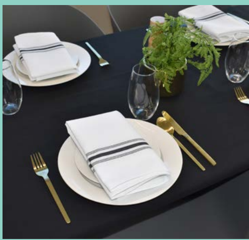
Table Linen Table Cloths, Overlays & Napkins