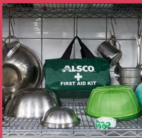
First Aid First Aid Kits, Defibrillators, Eye Wash Stations & First Aid Training