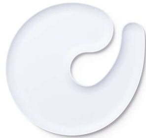
White, mat Size: 237 x 228 x 11 mm Weight: 177 g