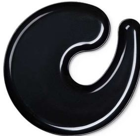
Black, glossy Size: 237 x 228 x 11 mm Weight: 177 g