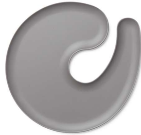
Grey, mat Size: 237 x 228 x 11 mm Weight: 177 g

The plate comes in multiple variations to meet every event's unique style.