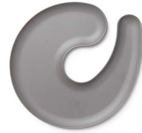
Grey, mat Size: 216 x 207 x 11 mm Weight: 135 g