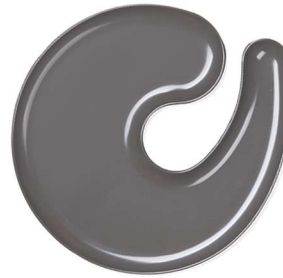
Grey, glossy Size: 237 x 228 x 11 mm Weight: 177 g