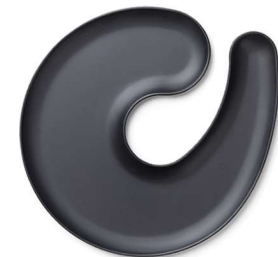
Black, mat Size: 216 x 207 x 11 mm Weight: 135 g