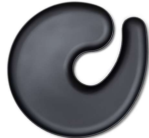
Black, mat Size: 237 x 228 x 11 mm Weight: 177 g