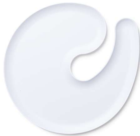
White, mat for champagne glasses Size: 243 x 230 x 10 mm Weight: 180 g