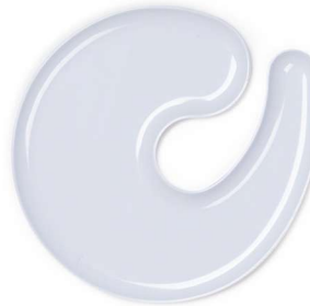
White, glossy Size: 237 x 228 x 11 mm Weight: 177 g