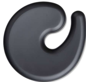
Black, mat for champagne glasses Size: 243 x 230 x 10 mm Weight: 180 g