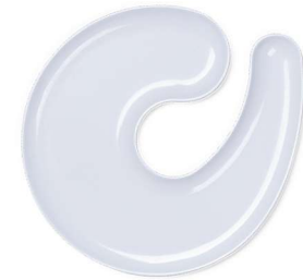
White, glossy Size: 216 x 207 x 11 mm Weight: 135 g