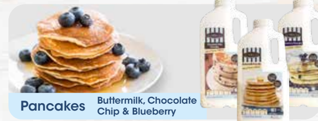
Pancakes Buttermilk, Chocolate Chip & Blueberry

YesYouCan provides you with delicious, convenient pancakes that everyone in the family will absolutely love! While our Artisan Range is a healthier option that is vegan with high fibre content.