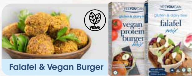
Falafel & Vegan Burger

YesYouCan Savoury Snack Mix makes Pao de Queijo, Brazil's famous gluten free cheese bread snacks. They are crunchy on the outside and cheesy and gooey on the inside.