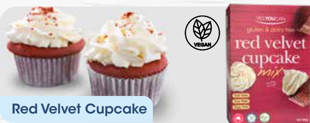
Red Velvet Cupcake

YesYouCan Chocolate Mud Cake is a rich and decadent treat that everyone will enjoy. So easy to make, just add wet ingredients, stir with a spoon and bake, no mixer required!