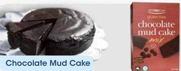
Chocolate Mud Cake

YesYouCan Banana Bread Mix includes real banana flakes for a delicious natural taste. Lightly spiced with cinnamon and nutmeg for a delicious café experience at home.