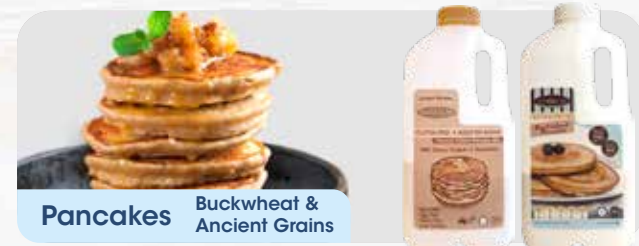
Pancakes Buckwheat & Ancient Grains

Convenient and easy to prepare, just add water, shake and pan fry. Bonus, even kids can make them! Perfect for weekend breakfasts, enjoy on their own or add your favourite toppings.