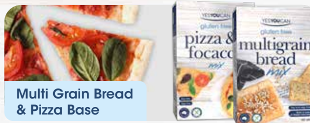
Multi Grain Bread & Pizza Base

YesYouCan Plain and Self Raising Flours are versatile, designed to replace regular flour cup-for-cup in your favourite recipes. Dairy and egg free, suitable for vegan cooking and baking.