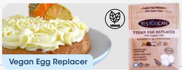
Vegan Egg Replacer

YesYouCan Artisan range is reduced sugar, vegan, low sodium and high fibre, providing a delicious guilt free option for a healthier diet.