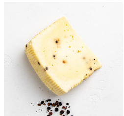
CACIO PEPPER Cow milk cheese with black peppercorns (pecorino style)