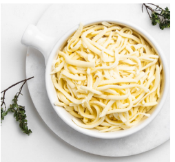
SHREDDED MOZZARELLA Shredded gourmet mozzarella