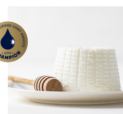
BUFFALO RICOTTA Traditional whey ricotta made from buffalo milk