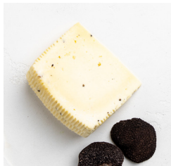
CACIO TRUFFLE Cow milk cheese with black truffles (pecorino style)