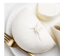
BUFFALO AVERSANA Buffalo milk mozzarella (1Kg)