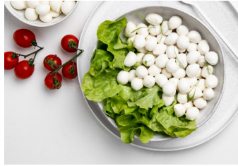
BABY BOCCONCINI Petite sized mozzarella (4g)