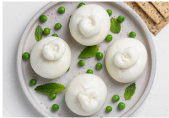
MINI BURRATA Decadent mozzarella filled with stracciatella (60g)