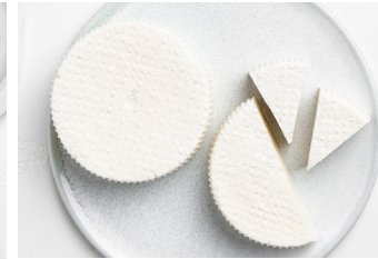
ORGANIC CACIOTTA Fresh cow milk cheese with a semi soft texture