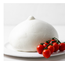
BUFFALO ZIZZONA Buffalo milk mozzarella (3Kg approx)