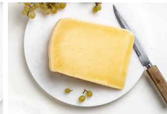
NABUCCO Semi matured cow milk cheese