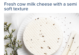
CACIOTTA WITH TRUFFLE Fresh cow milk cheese with black truffles