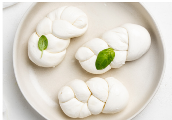
TRECCE Hand braided mozzarella (125g)