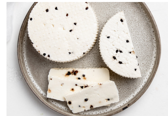
ORGANIC CACIOTTA WITH PEPPER Fresh cow milk cheese with black peppercorns