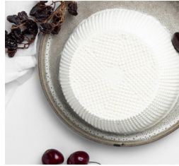
TRADITIONAL RICOTTA Traditional whey ricotta with a soft texture