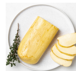
SCAMORZA AFFUMICATA Gourmet smoked mozzarella