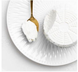
RICOTTA DELICATA Smooth and delicate whey ricotta