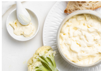
STRACCIATELLA Mozzarella strips in cream (burrata filling)