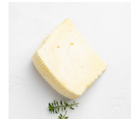
CACIO Cow milk cheese (pecorino style)