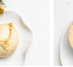
SMOKED CACIOTTA Fresh cow milk cheese, smoked