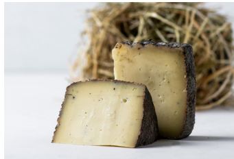
SECRETS OF THE FOREST 80% buffalo milk cheese with black truffles, matured in hay