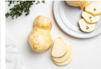
ORGANIC SMOKED MOZZARELLA Gourmet smoked mozzarella