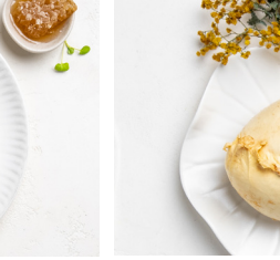
SMOKED BUFFALO MOZZARELLA Beechwood smoked buffalo milk mozzarella (125g)