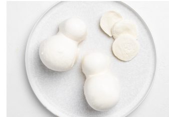
ORGANIC MOZZARELLA Gourmet mozzarella