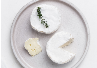
STELLA ALPINA MINI Semi soft alpine-style mould ripened cheese