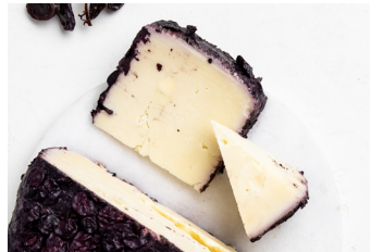
DRUNKEN BUFFALO 80% buffalo milk cheese, matured in Nebbiolo grape skins and must