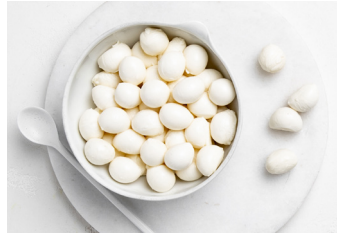
CHERRY BOCCONCINI Cherry sized mozzarella (10g)