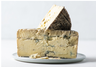
ISOLATION BLUE Matured blue vein cheese