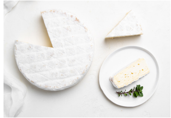
STELLA ALPINA Semi soft alpine-style mould ripened cheese