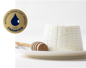
BUFFALO RICOTTA Traditional whey ricotta made from buffalo milk