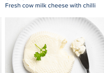
SQUACQUERONE Soft, spreadable cheese (stracchino)