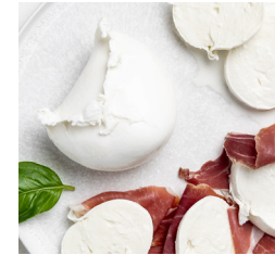
BUFFALO MOZZARELLA Plump ball of buffalo milk mozzarella (125g)