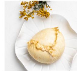
SMOKED BUFFALO MOZZARELLA Beechwood smoked buffalo milk mozzarella (125g)