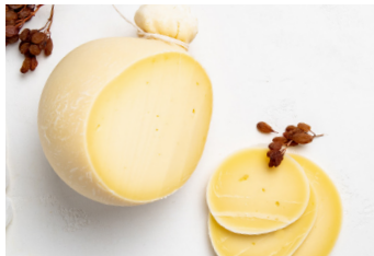
CACIOCAVALLO Traditional aged mozzarella