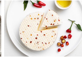
CACIOTTA WITH CHILLI Fresh cow milk cheese with chilli