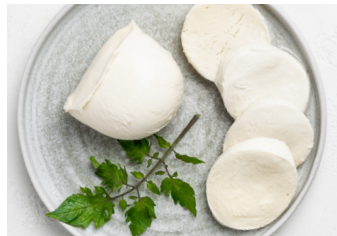
FIOR DI LATTE Plump fresh mozzarella (125g)