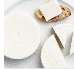
BUFFALO CACIOTTA Fresh buffalo milk cheese with a semi soft texture