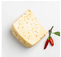
CACIO CHILLI Cow milk cheese with chilli (pecorino style)