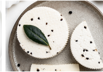
CACIOTTA WITH PEPPER Fresh cow milk cheese with black peppercorns