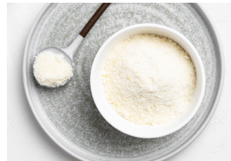
GRATED PARMESAN Finely grated parmesan cheese