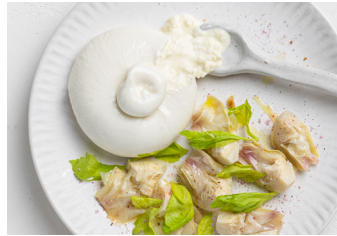
BURRATA Decadent mozzarella filled with stracciatella (125g)