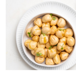
SMOKED BOCCONCINI Bite sized smoked mozzarella (10g)