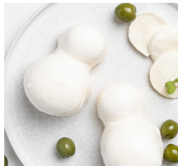
SCAMORZA BIANCA Gourmet mozzarella