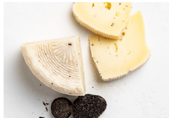
PANETTONE TRUFFLE Semi matured cow milk 'eye cheese' with black truffles