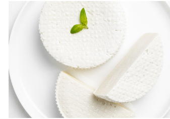
CACIOTTA Fresh cow milk cheese with a semi soft texture