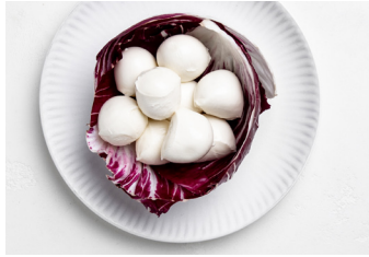
BOCCONCINI Bite sized mozzarella (25g)