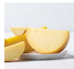
SMOKED CACIOCIVALLO Aged smoked mozzarella