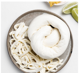
MEXICAN CHEESE String-type mozzarella (OAXACA)