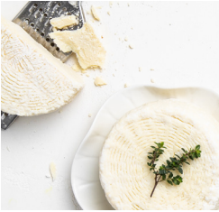
RICOTTA SALATA Air dried salted ricotta