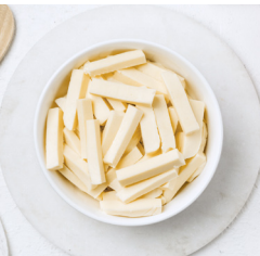
NAPOLI CUT Julienne style cut fresh mozzarella