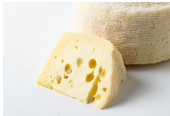
PANETTONE Semi matured cow milk 'eye cheese'