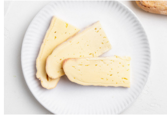
LAVATO Washed rind cow milk cheese (Taleggio style)