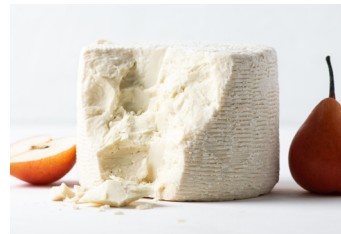
BUFFALOTTO 80% buffalo milk cheese, matured