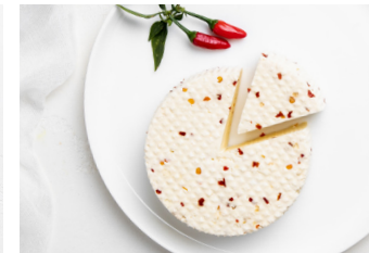
ORGANIC CACIOTTA WITH CHILLI Fresh cow milk cheese with chilli