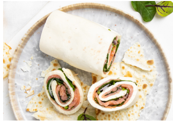
BOCCONCINI LEAF Flat mozzarella sheets, ready to be filled