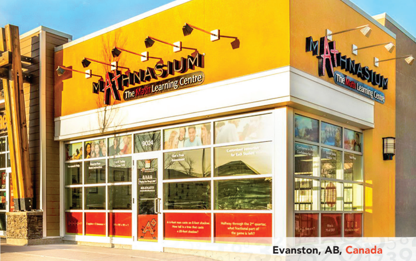
Evanston, AB, Canada