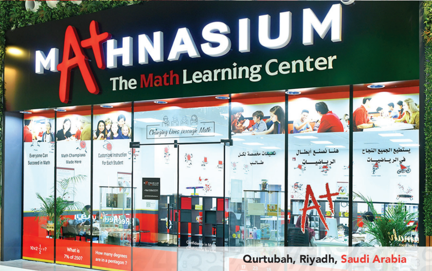
Qurtubah, Riyadh, Saudi Arabia