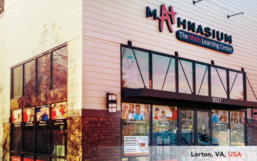
Lorton, VA, USA