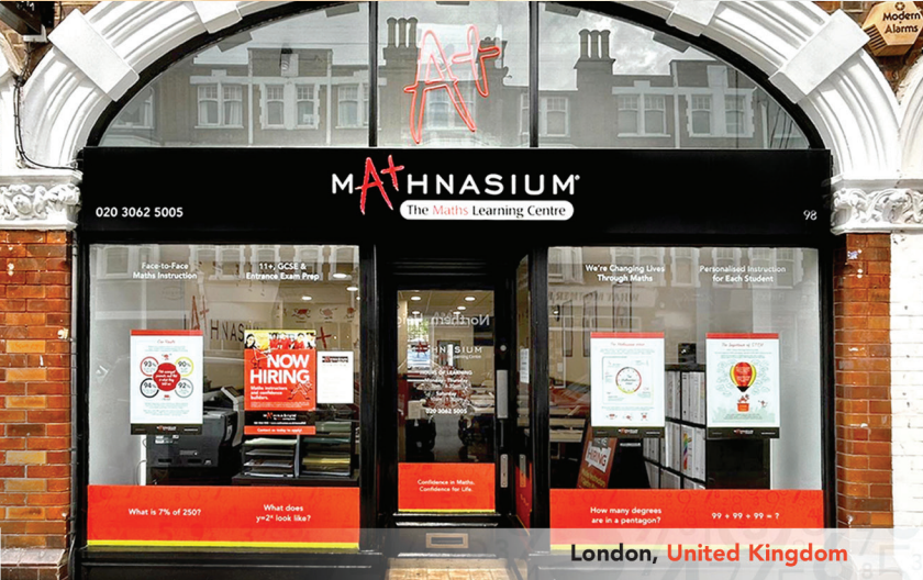
London, United Kingdom