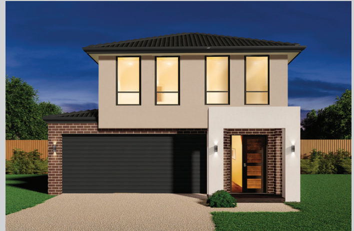
Facade colours and materials shown may not be available due to land estate design guidelines. Refer to your Henley new home consultant for clarification. Price excludes tiles, stone and/or full render to facade treatment if shown, timber windows, landscaping, fencing, driveway, decking, planter box and decorative lights or any change required by Developer to facade.

Eastwood CRANBOURNE EAST Lot No. 31 (306m 2 )