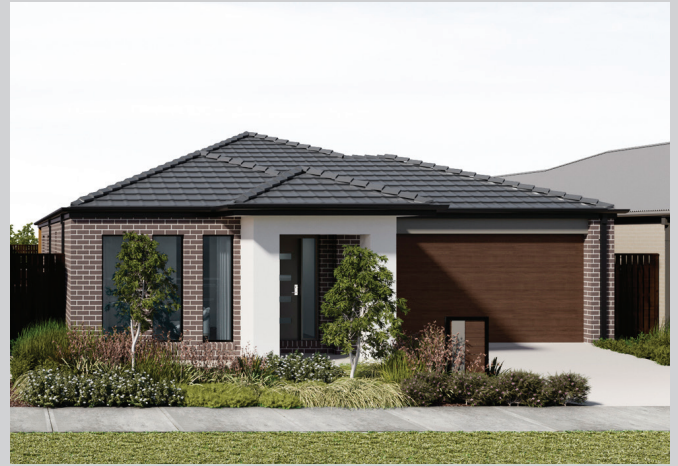
Facade colours and materials shown may not be available due to land estate design guidelines. Refer to your Henley new home consultant for clarification. Price excludes tiles, stone and/or full render to facade treatment if shown, timber windows, landscaping, fencing, driveway, decking, planter box and decorative lights or any change required by Developer to facade.

Platform DONNYBROOK Lot No. 230 (350m 2 )