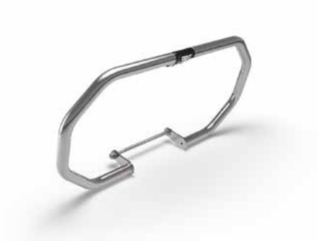
SILVER OCTAGON ENGINE GUARD