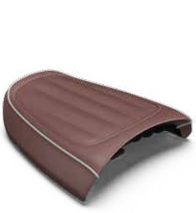
BROWN CUSTOM PASSENGER SEAT