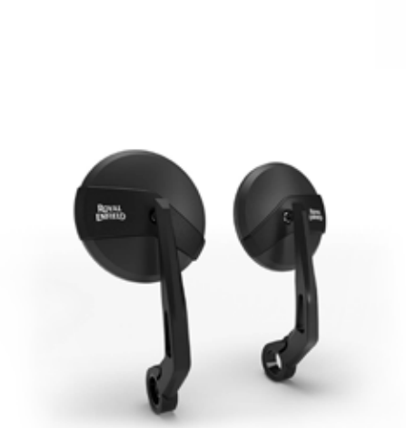
BLACK BAR END MIRRORS