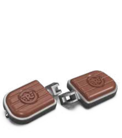
BROWN AND SILVER DELUXE FOOTPEGS