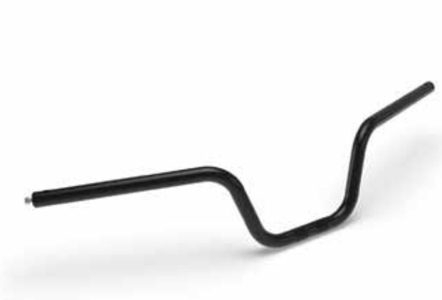
BLACK TOURING HANDLEBAR