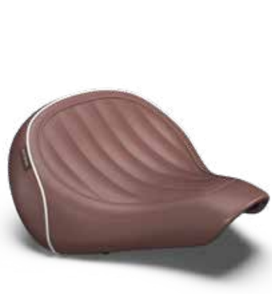
BROWN CUSTOM RIDER SEAT