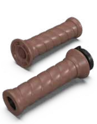
BROWN HANDLEBAR GRIPS