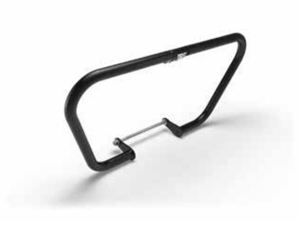
BLACK TRAPEZIUM ENGINE GUARD