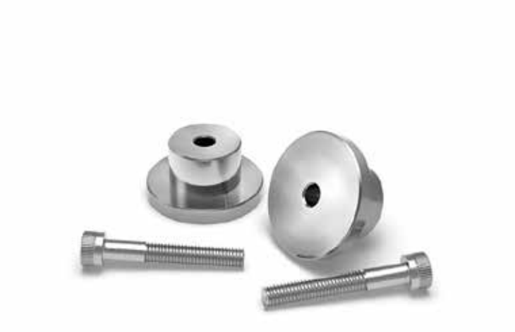
BAR END MIRROR MOUNTS