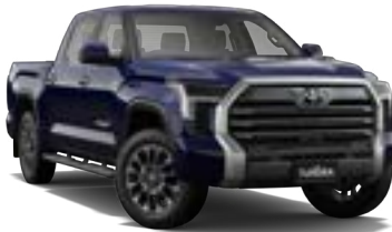
● Saturn Blue 8X8