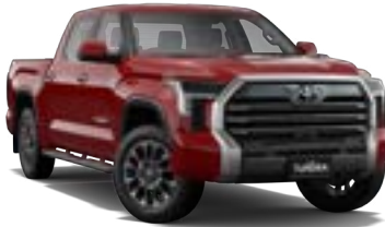
● Emotional Red 3U5