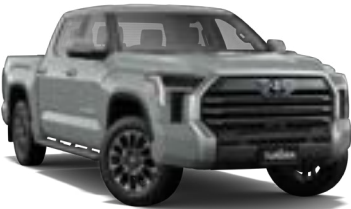
● Jungle Khaki 6X3