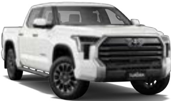
○ Glacier White 040