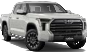
○ Frosted White 089