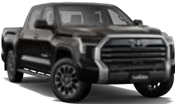
● Vintage Brown 4X4