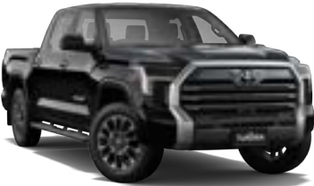
● Eclipse Black 218