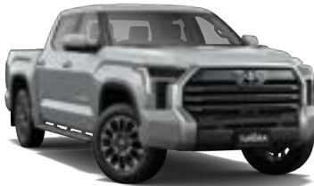
● Silver Storm 1J9