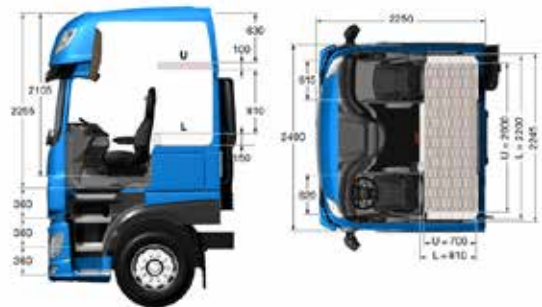
SUPER SPACE CAB

DAF Trucks Australia 66 Canterbury Road Bayswater VIC 3153 Phone (03) 9721 1600