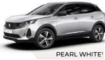
PEARL WHITE 1