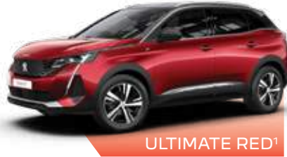
ULTIMATE RED 1