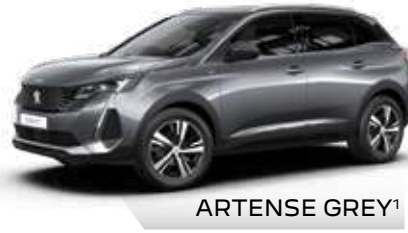
ARTENSE GREY 1