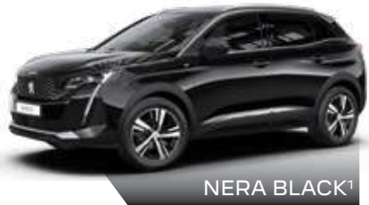
NERA BLACK 1