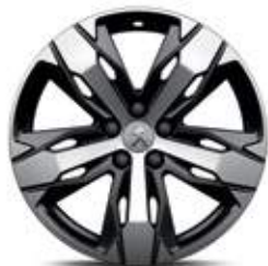
18" LOS ANGELES Alloy wheels (Standard on Allure)