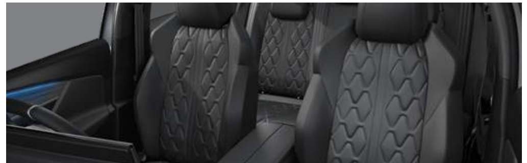
FULL GRAIN NAPPA LEATHER TRIM 2 (Optional on GT, standard on GT Sport)

Note: Paint colours are representative only and subject to variation due to the printing process. 1. Optional extra. 2. Leather appointed seats are a combination of genuine leather & synthetic materials and are not wholly leather.