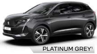
PLATINUM GREY 1