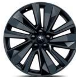
19" WASHINGTON Onyx black finish diamond cut alloy wheels (Standard on GT SPORT)