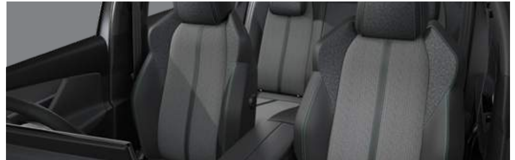
LEATHER EFFECT / 'COLYN' FABRIC TRIM (Standard on Allure)