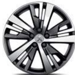
18" DETROIT Two tone finish diamond cut alloy wheels (Standard on GT)