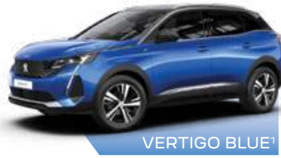
VERTIGO BLUE 1