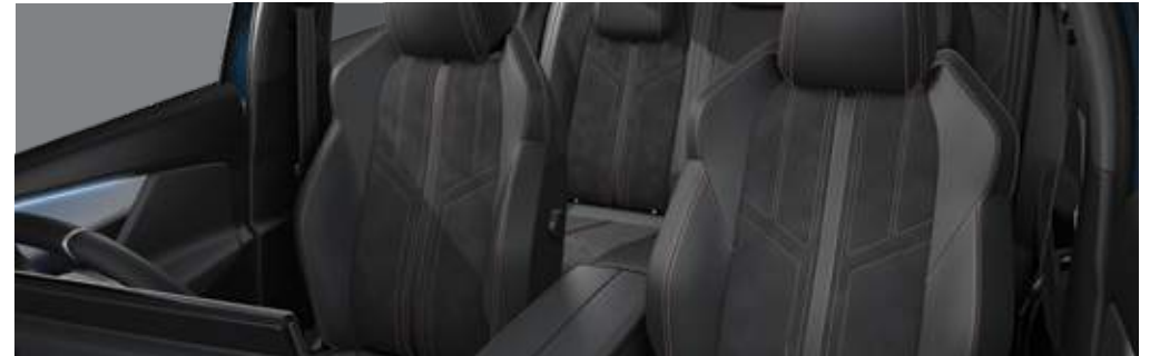
LEATHER EFFECT / ALCANTARA® (Standard on GT)