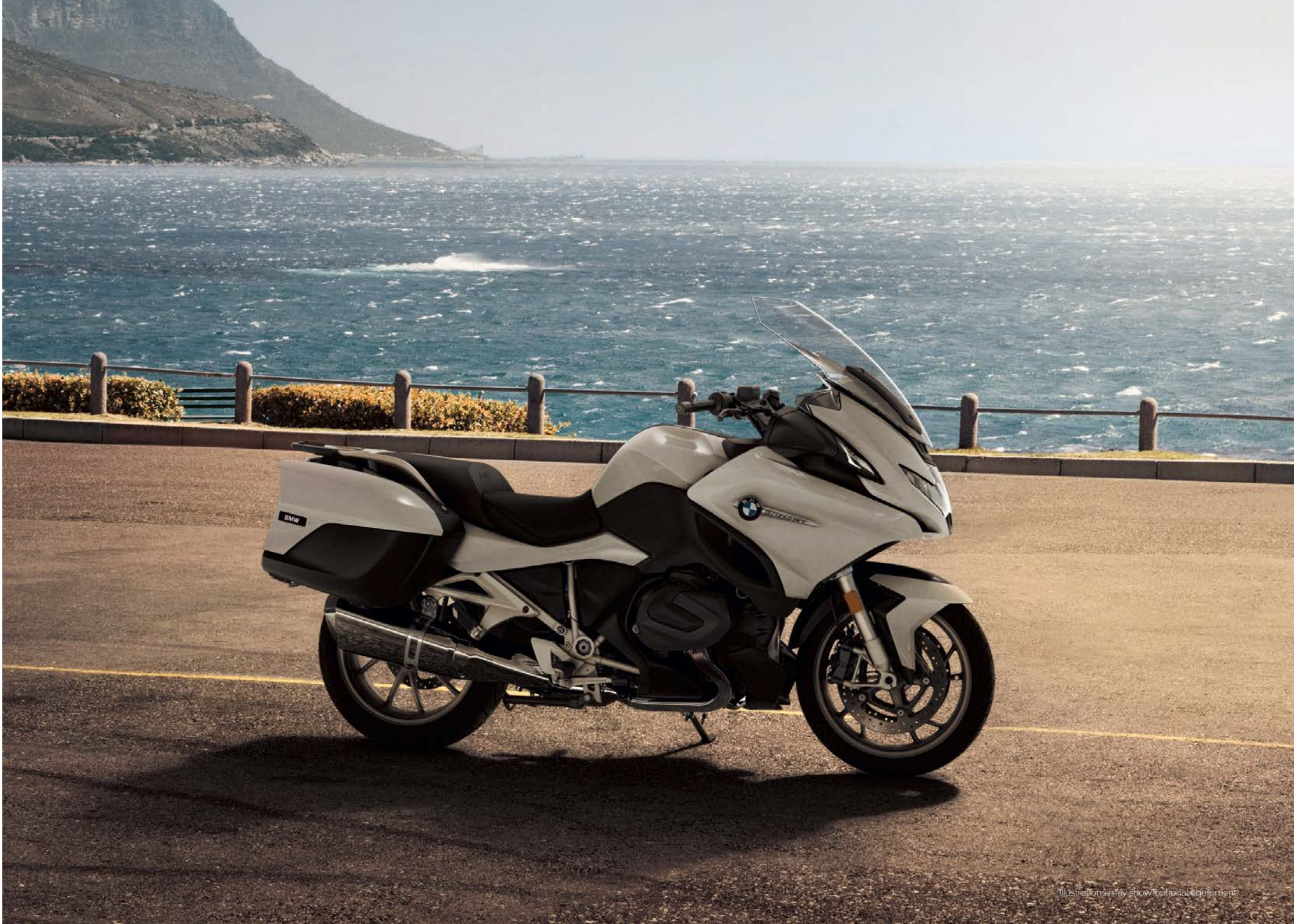
Illustrations may show optional equipment