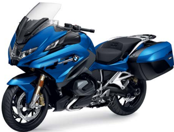
Racing Blue Metallic