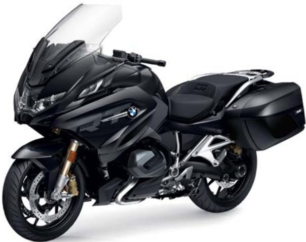
Black Storm Metallic 2