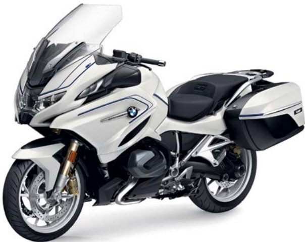
Mineral White Metallic