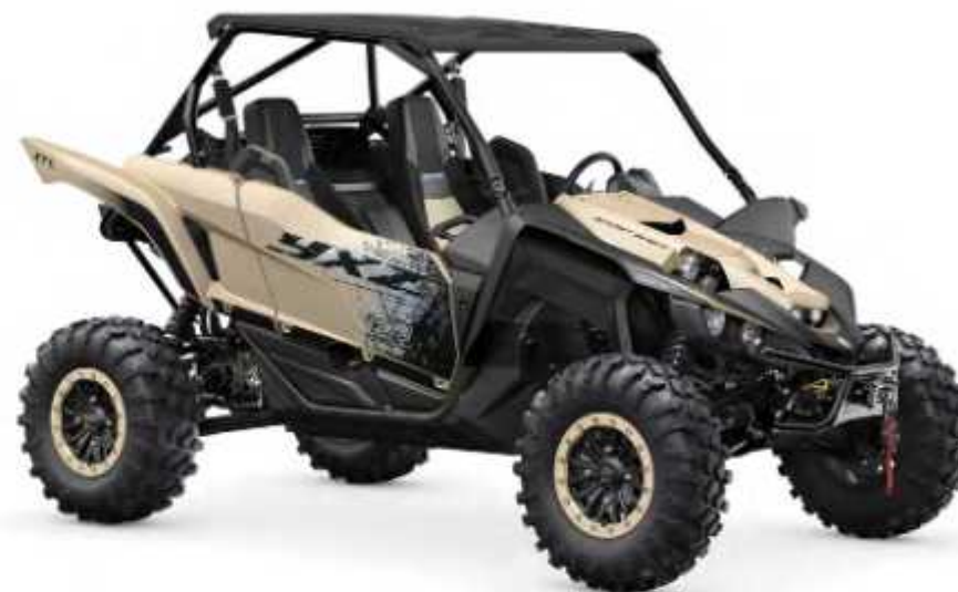
Desert Tan / Tactical Black

Upgraded centreline lighting provides enhanced visibility. A custom front grab bar mounts a heavy duty WARN® winch package with integrated driver controls while the composite suntop, high-quality painted bodywork, contrast-stitched seats and auxiliary lights complete the package.