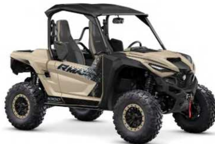
Desert Tan / Tactical Black

The Wolverine RMAX2 1000 XT-R follows our development philosophy of "Jin-Ki Kanno" – which translates from the Japanese as "the exhilaration of being one with the machine". The result is a super-capable off-roader, in which both driver and passenger feel confident to master the very toughest terrain.