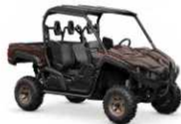
Viking SE - Copperhead Metallic

Additional accessories on the Viking SE include high-quality painted bodywork, aluminium wheels, overfenders, hard sun-top and under-seat storage.