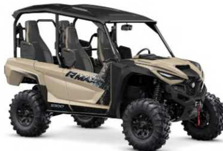
Desert Tan / Tactical Black

The Wolverine RMAX 1000 family follows our development philosophy of "Jin-Ki Kanno" - which translates from Japanese as "The exhilaration of being one with the machine" - bringing you a super-capable off-roader, in which driver and passengers feel confident to master and enjoy the very toughest terrain.