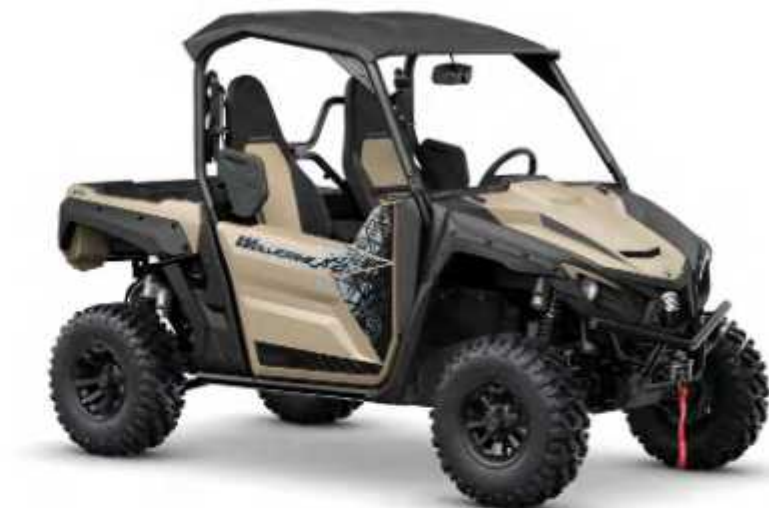
Desert Tan / Tactical Black

Wolverine X2 XT-R - when the going gets XT-Reme.