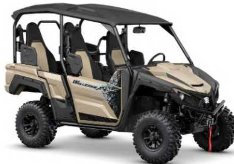
Desert Tan / Tactical Black

Kitted out in top-shelf XT-R trim including durable 27-inch radial tyres, a WARN® VRX 4500 winch, and high-quality painted body and graphics package with colour-matched aluminium wheels, Wolverine X4 XT-R sits four in comfort ready to take on tough terrain.