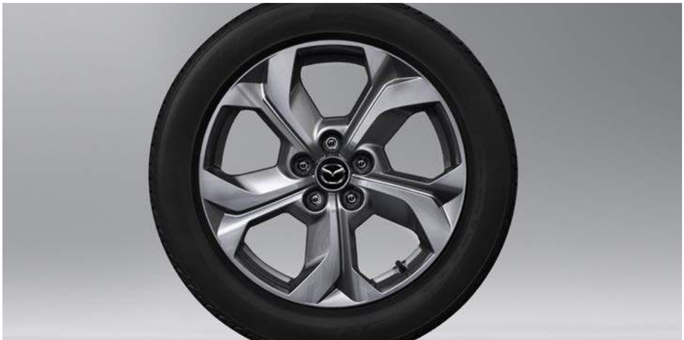
18-inch bright alloy

Sustainable is more stylish than ever with a luxurious trim that adds even more individual appeal. The bold wheels are also designed to give First-Ever Mazda MX-30 a more exciting street presence.