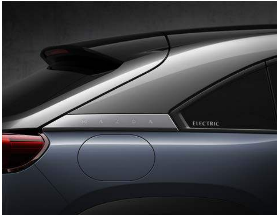
Polymetal Grey Metallic with black roof top and silver sides.