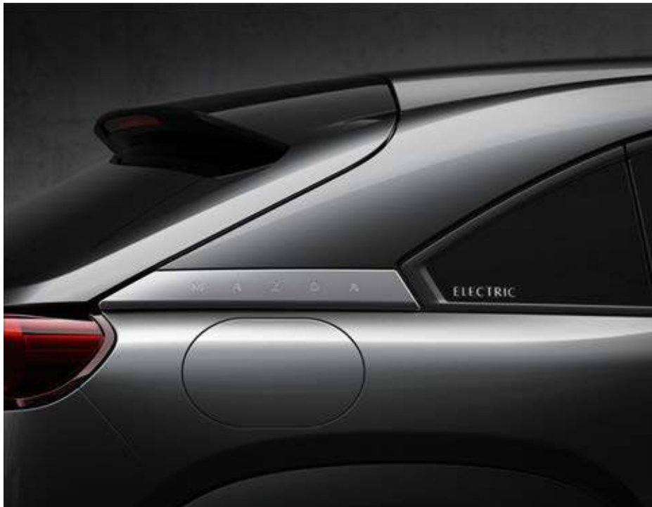
Machine Grey Metallic