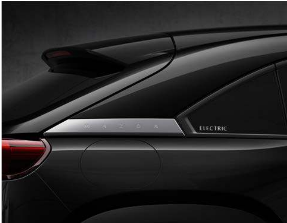
Jet Black Mica