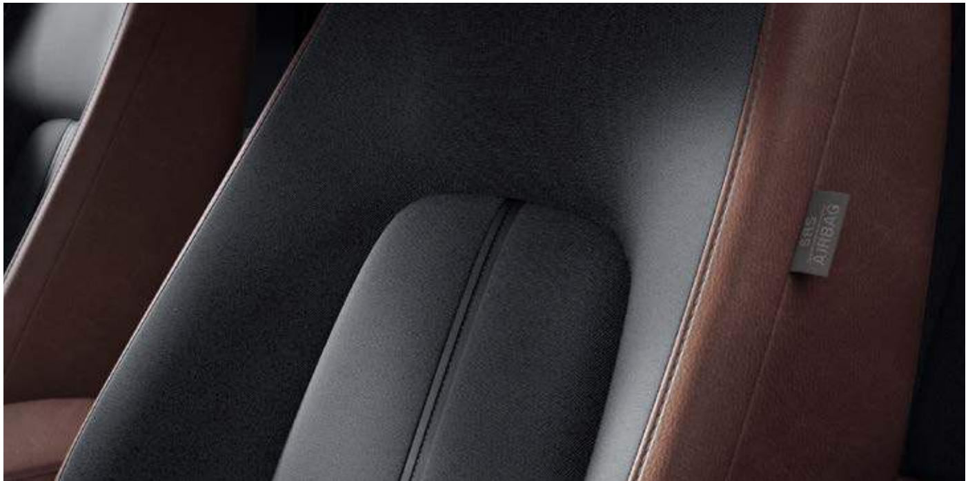
Vintage Brown Maztex with black cloth