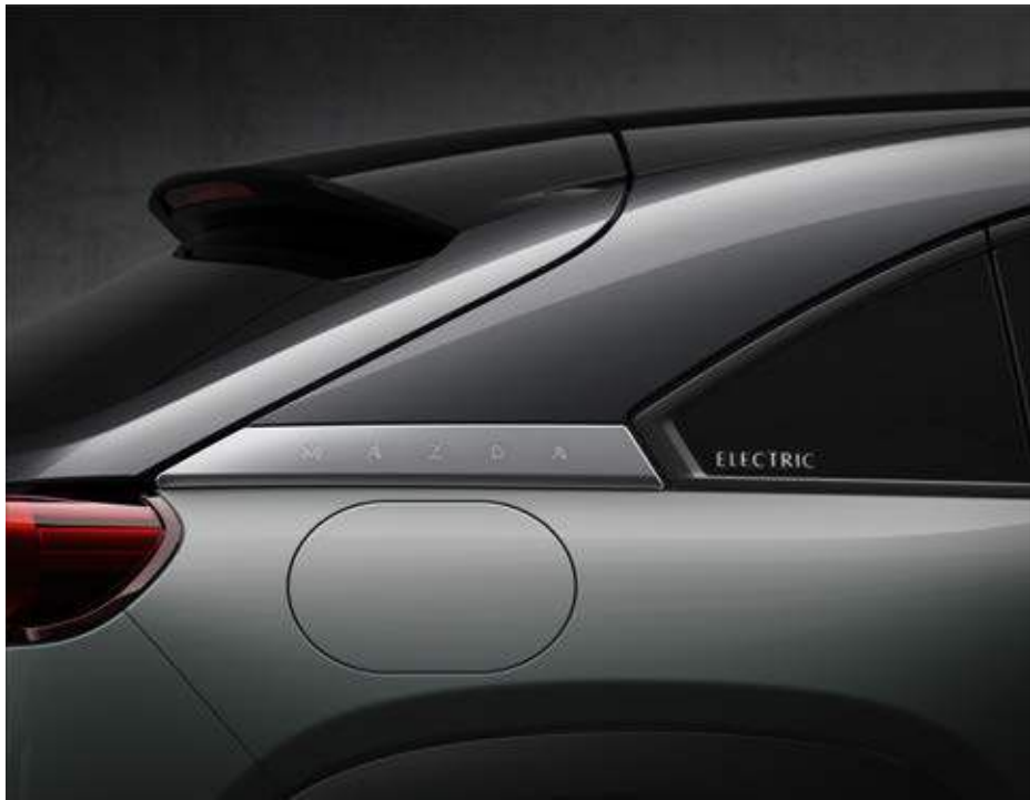
Ceramic Metallic with black roof top and grey sides.