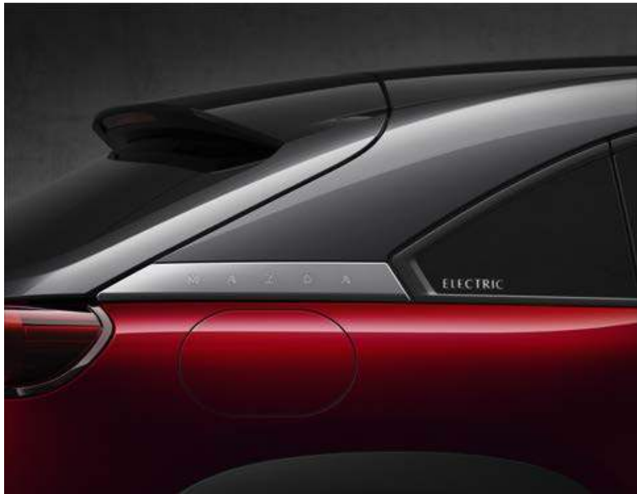
Soul Red Crystal Metallic with black roof top and grey sides.