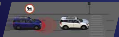
AUTOMATIC EMERGENCY BRAKING