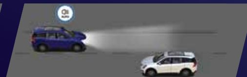
HIGH BEAM ASSIST