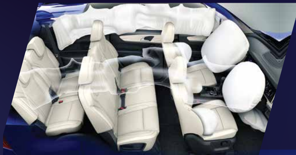
6 AIRBAGS STANDARD + KNEE BAG (AX7L)