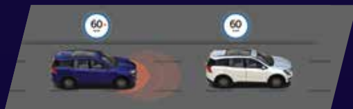
ADAPTIVE CRUISE CONTROL