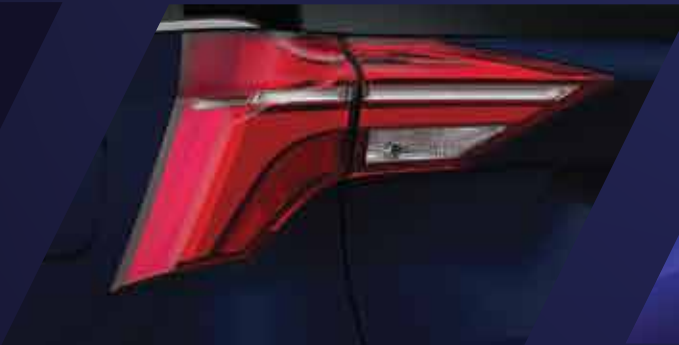
CAPTIVATING ARROW-HEAD LED TAILLAMPS