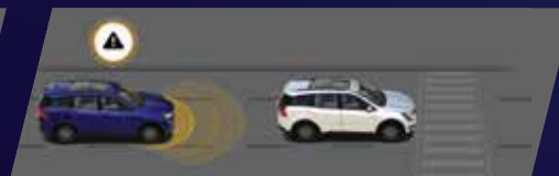
FORWARD COLLISION WARNING