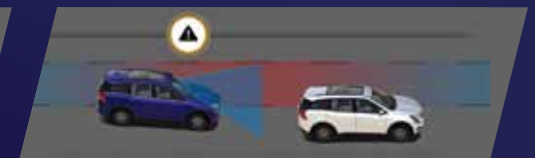
LANE KEEP ASSIST