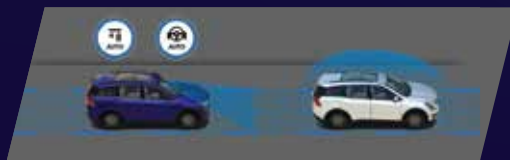
SMART PILOT ASSIST

HERE'S HOW ADAS PROTECTS YOUR XUV700 ON EVERY DRIVE: