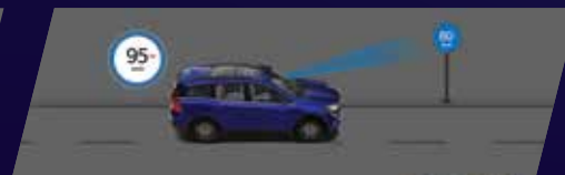
TRAFFIC SIGN RECOGNITION