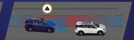
LANE DEPARTURE WARNING