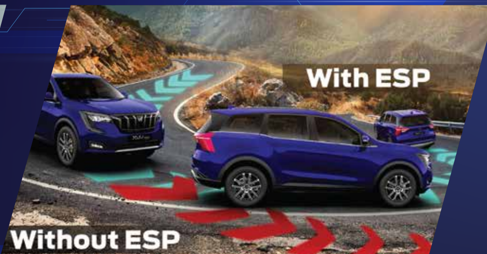
LATEST-GEN ELECTRONIC STABILITY PROGRAM