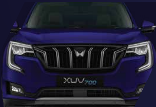
STRIKING CLEAR-VIEW LED HEADLAMPS WITH DRL

The new XUV700 is effortlessly impressive with it's bold stance and style lines. Add the Skyroof™ and distinct LED lights, and you've got an SUV that can't be ignored.