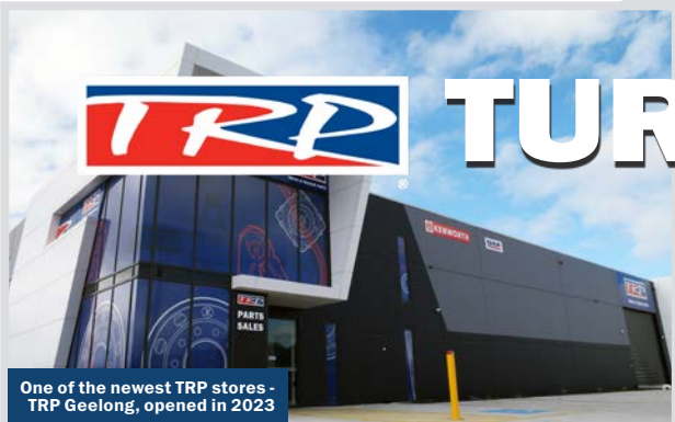
One of the newest TRP stores - TRP Geelong, opened in 2023