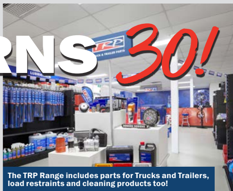
The TRP Range includes parts for Trucks and Trailers, load restraints and cleaning products too!