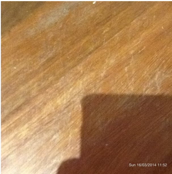
Kitchen/Meals: Floor coverings